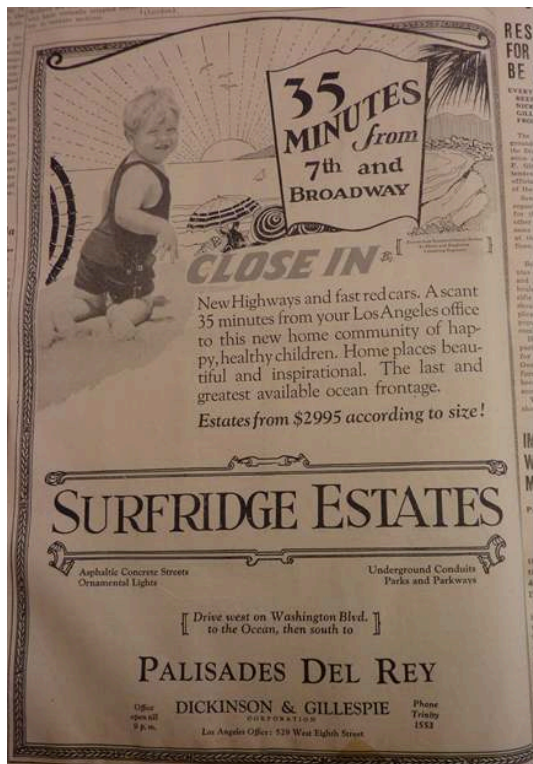
Figure 1. Advertisement for the Surfridge Estates in Palisades Del Rey, 1926.