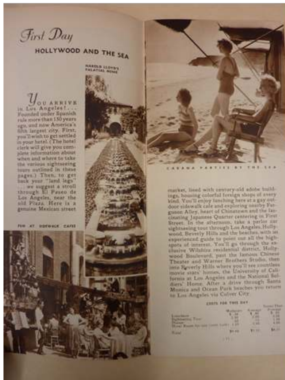
Figure 3. “A new 2 weeks vacation trip to California,” guidebook itinerary by the All-Year Club, 1933. Box 10, Folder 10-10, Greater Los Angeles Visitors and Convention Bureau collection. Special Collections, Oviatt Library, California State University, Northridge.

sensual glamour to be found at the intersection of Hollywood and the Pacific. Lured by exotic tales of “cabana parties by the sea,” tourists came to Los Angeles to see, among other attractions, the semi-nude bodies of the stars they usually could only admire on the screen. One of the city’s main selling points, in other words, was its corporeal capital as the center of the movie industry.