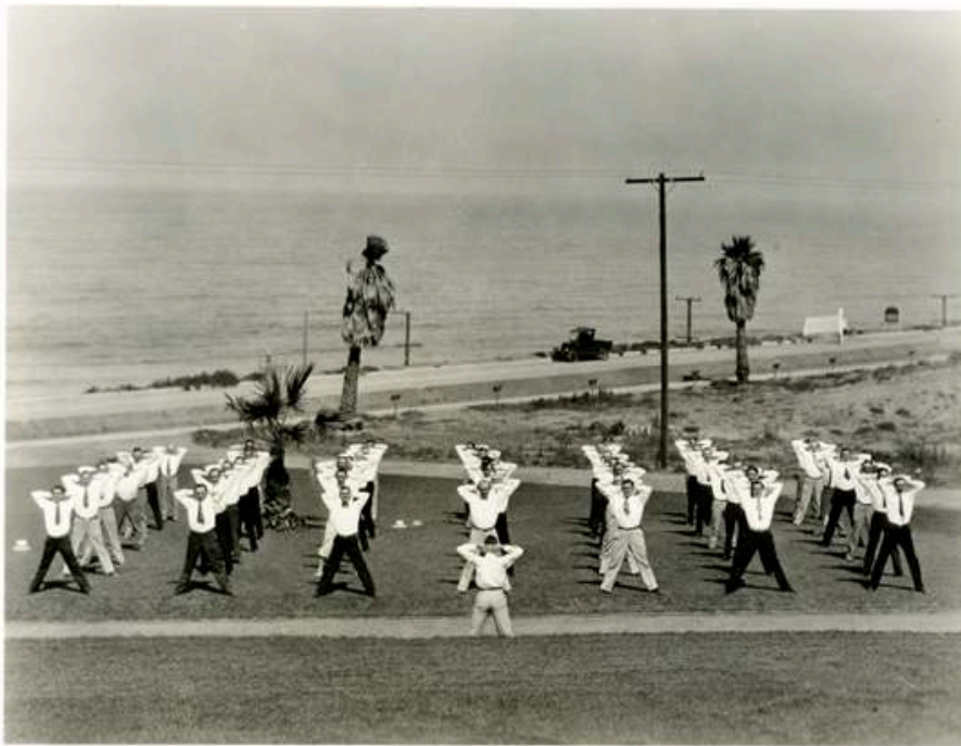
Figure 5. Every morning, employees of the Dickinson & Gillespie real estate company practiced calisthenics on the beach.