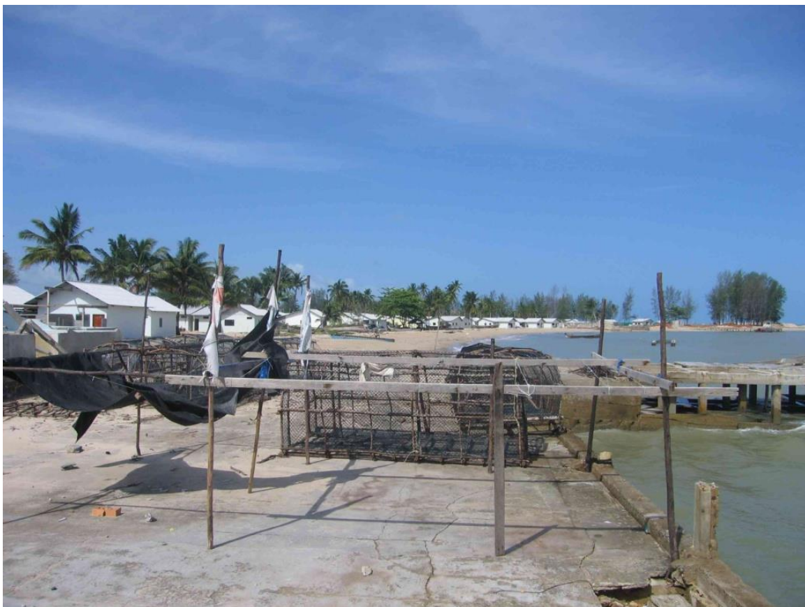
Figure 2. The rebuilt village of Ban Nam Khem, on the site of the original village and in a similarly exposed position

were to be deported, while the registered ones were promised, but not really given, help ... the authorities showed complete indifference to their fate” (Cohen, 2009: 188). Both the disaster event and the state responses to the event were therefore stressors for vulnerable migrant labourers.