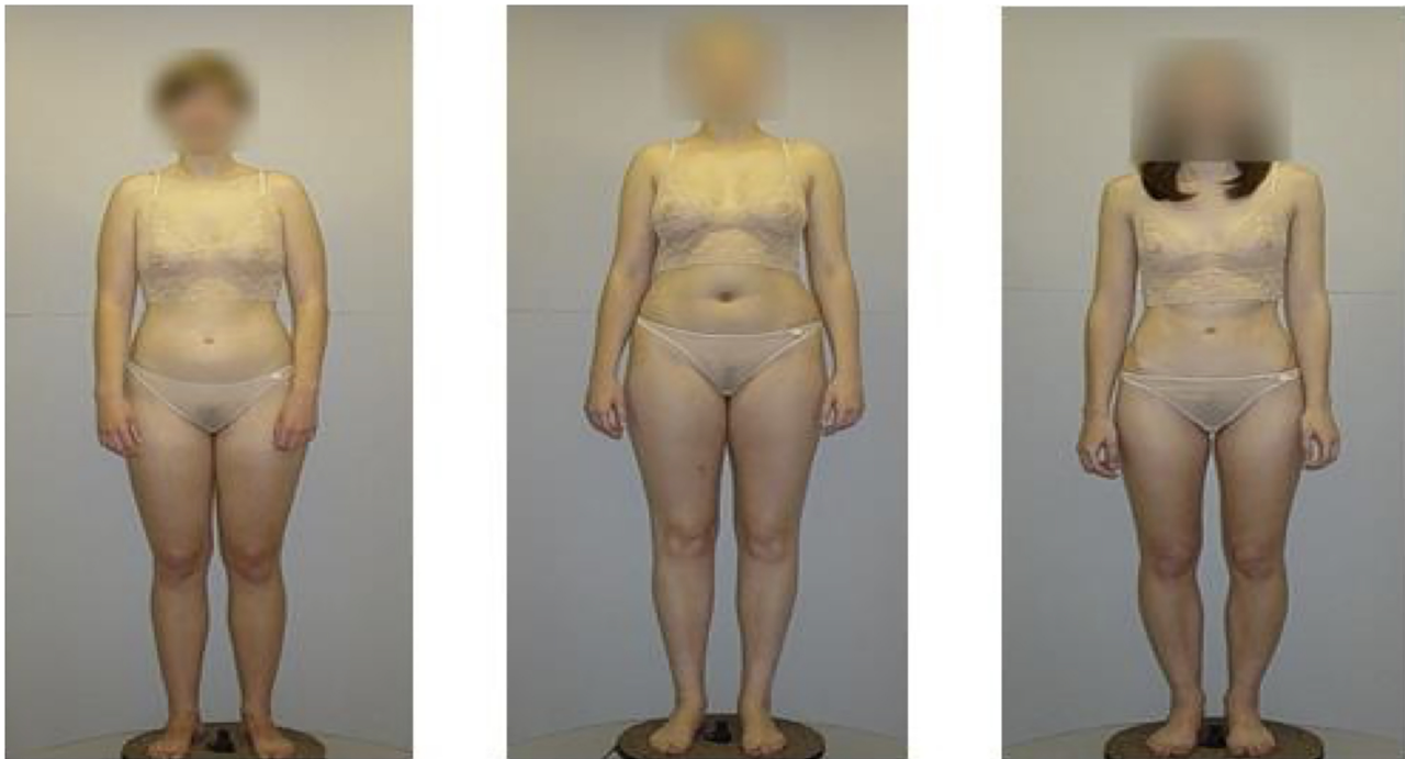
FIGURE 1 | An example of the 2D forward facing images used in this study [the stimuli were collected in the Smith et al. (2007a) study].

participants were given a debrief which outlined the aims and predictions of the study.