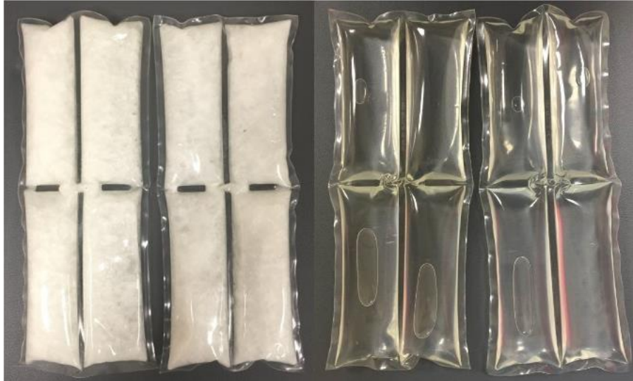
Figure 2: Two Glacier Tek 15°C PCM packs in the frozen state (left), and in their melted state (right).