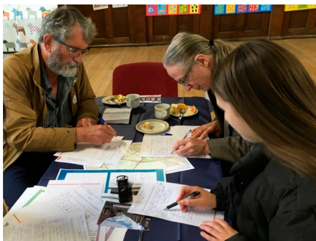
Figure 2. Participants developing ideas in the ‘group passing’ activity.

Data collection in the workshop comprised ideas written by participants on the templates provided (see Figure 1 for example data). All data were stored in a locked filing cabinet within an access controlled workspace. The workshop activities generated an extensive list of ideas and suggestions for facilitating social interaction within the immediate local area. Each group wrote down every idea that resulted from the activities they completed. After the workshop, we combined these ideas into one longer list and grouped and organised them under three overarching themes and 12 sub-themes that captured the overall range, content and types of ideas [37]. Themes and sub-themes were developed by two researchers (JL, TS) and then discussed with all members of the research team.