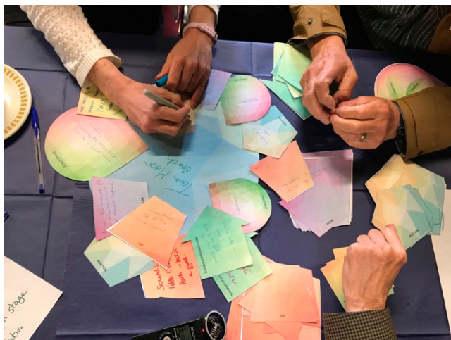
Figure 3. Participants generating an idea to develop a beach and water feature on an existing outdoor area of green space.

As described earlier, the workshop was designed to build on the findings from our interviews. An extensive list of ideas was generated through our ideation activities, which we combined and organised under themes and sub-themes. Table 4 summarises the themes and sub-themes identified in our analysis of the written workshop data. Participants commented that the workshop had been enjoyable and thought-provoking—an outcome that supports us in challenging ageist stereotypes of older people as unable or unwilling to engage in creative, disruptive or wild thinking.