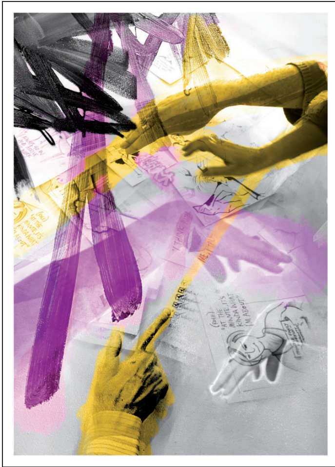
Figure 2. The gesture.

Hands begin to occupy table-top, creating a space. Claimed and inhabited. Arm moves through air, sweeping across material. Vectors of energy, carrying momentum. Before the statement - the rehearsal, the demonstration. Bodies join with paper to hold and place. I see the timing, the pause, the build-up. Shocked by their own hands, surprised by movement. What has been held now is holding.