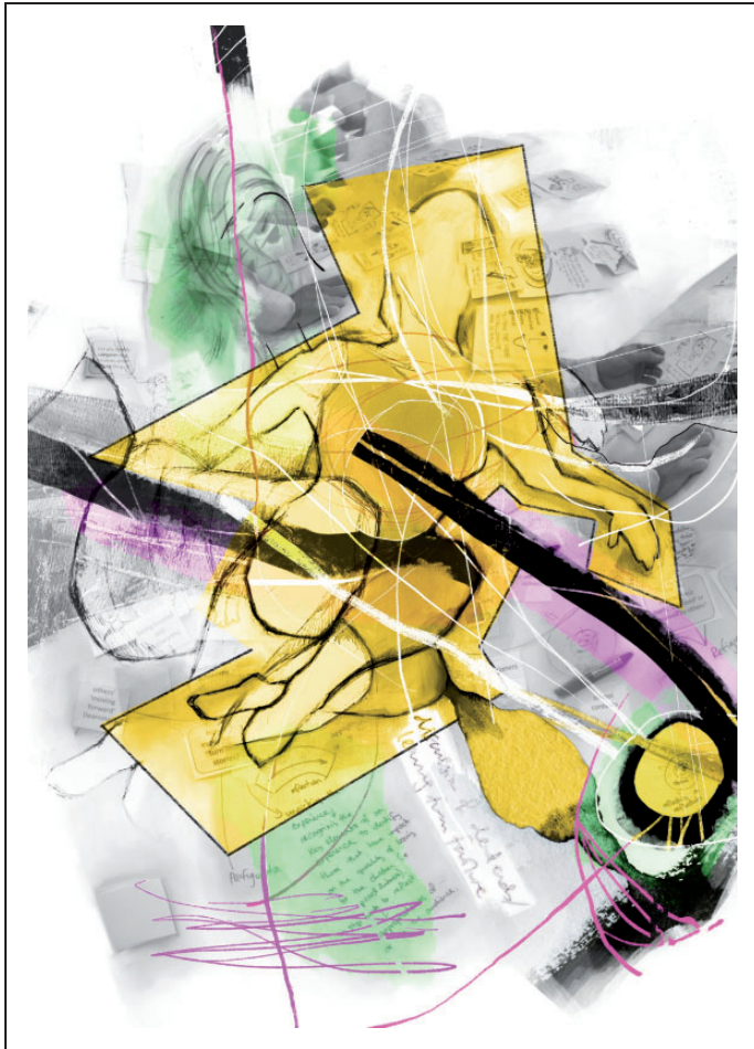
Figure 4. Assemblage.

More than the sum of their parts; They approach a site of strange surgery. Proximity is pushing possibilities, Threads pull and open spaces. The table is a Body without Organs On its surface, operations gather what is useful and create the body moving over them.