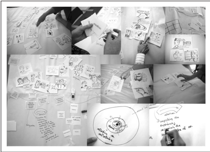
Figure 1. Example ‘original’ documentary images from the Sensemaking study.

(Fox & Alldred, 2019) in the social sciences, describing the potential of all things (including people, objects, places, concepts, memory, imagination) to produce material affects; for human subjects, in the body and emotions (Barad, 1996; Braidotti, 2019). This immanent, material way of looking at reality is characterised in the philosophy of Deleuze and Guattari (1987, 1994), which I used as a way to disrupt traditional approaches to Sensemaking and find productive ways forward.