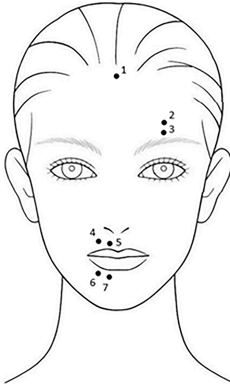
Fig 1. The points indicate where the electrodes were placed for each participant. Electrodes 2–3 recorded signals from the Frontalis muscle. Electrodes 4–5 recorded signals from the orbicularis oris superior muscle. Electrodes 6–7 recorded signals from the orbicularis oris inferior muscle. Electrode 1 was an unshielded grounding electrode.

https://doi.org/10.1371/journal.pone.0238920.g001