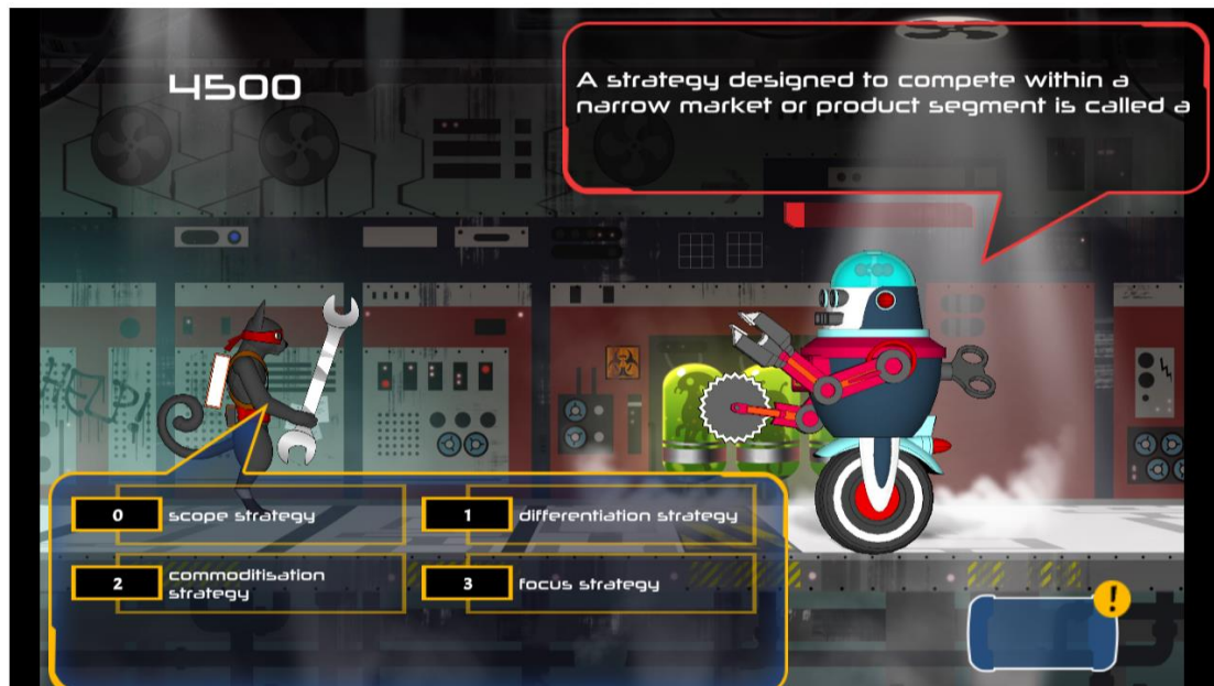
Figure 2. Screenshot from the FLIP2G game

As soon as the game is over, the instructor uses the learning analytics to identify the concepts/theories that students find difficult to understand and explain them further and/or provide guidance about the learning material students have to revise. This means that even students that have not accessed the theory before the workshop can benefit by playing the game as they will receive specific instructions on what they need to access.