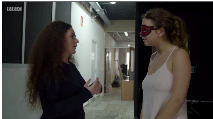
Figure 5: “You say you’re okay...”

Torbe interrupts shooting. The actress says, “Don’t bother us with this nonsense” and asserts direct to the documentary camera “I like it!” Then she and Anna have a conversation: