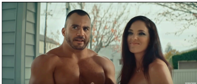
Figure 1: “I’d never act like that in real life”

KEYWORDS Pornography; porn literacy; Porn Laid Bare ; porn studies; sex education; young people; youth programming