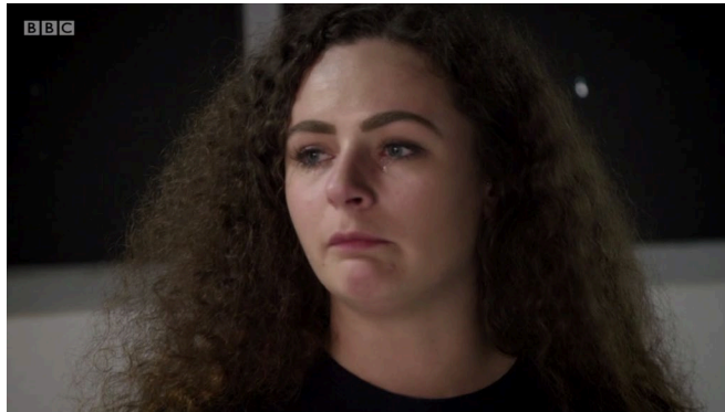
Figure 6: "I'm really worried."