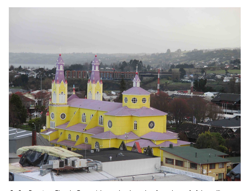
Figure 2. San Francisco Church, Castro (photo taken by author from the roof of the mall).