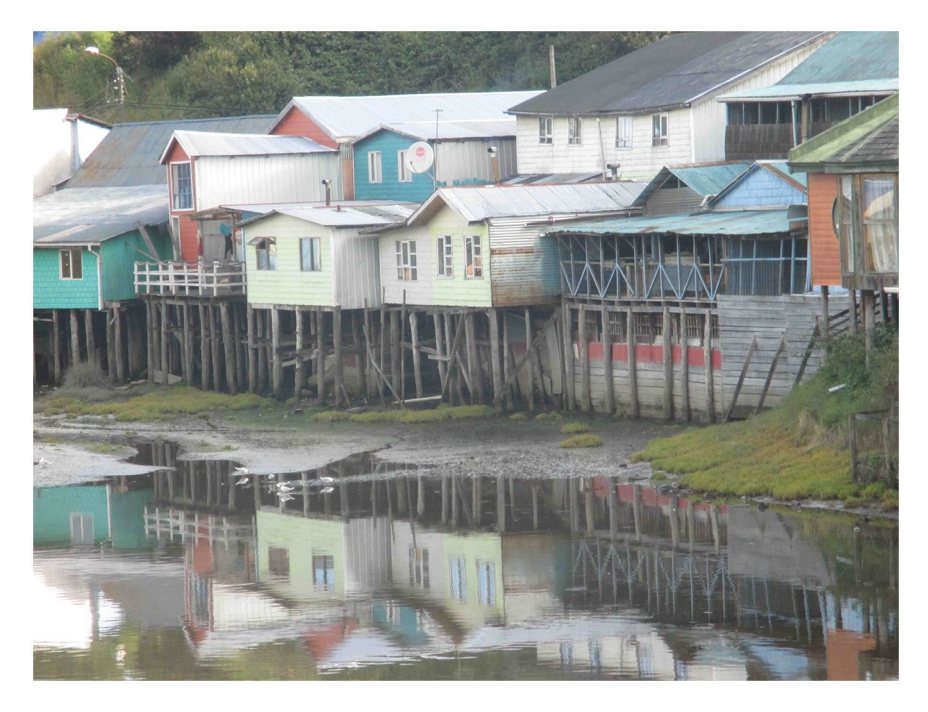
Figure 3. Palafitos in Castro (photo by author).

also attend to capitalist commodification in particular, as a force that gains power because of its ability generate de-/re-territorialization.<sup>9</sup>