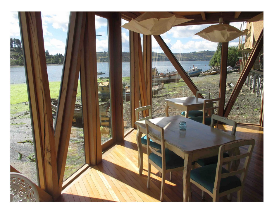
Figure 4. Palafito re-territorialized, Castro.

In other visits I made to residential palafitos, I observed similar layouts and surprising uses, such as a chicken coop on the far-side hanging over the water in one case. The renovation of palafitos for the tourist gaze is clearly removed from how these spaces are typically used in everyday life. In places like hotels with their spectacular designs, the palafito itself is de/reterritorialized for the tourist gaze (Figure 4).