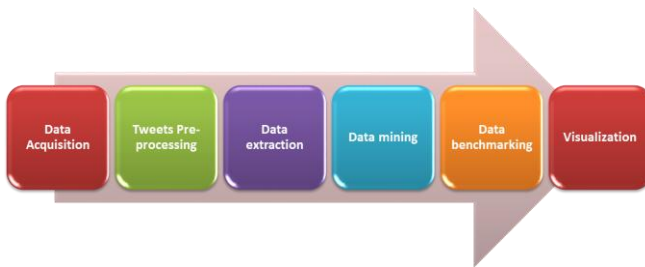
Fig. 1: System Components

This section presents the different modules of our system. Overall, the system has five main process components (refer figure 1) viz Data extraction, tweets pre-processing, data mining, Data benchmarking and data visualization as depicted in figure 1.