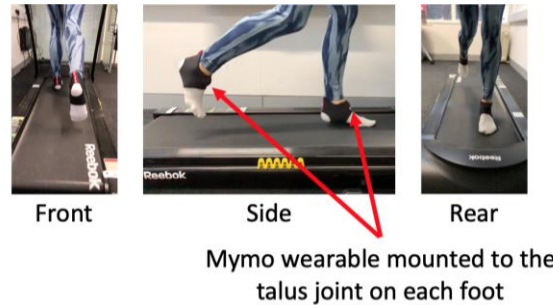
Figure 1: Example of video capture with Mymo sensor from front, side and rear perspectives

It is shown that different levels of support-cushioning technology within a running shoe can adversely affect an individual’s GCT [21]. For example, shoes utilizing Air® chamber technology often increase GCT, whereas ‘barefoot’ style shoes exhibit a shorter GCT.