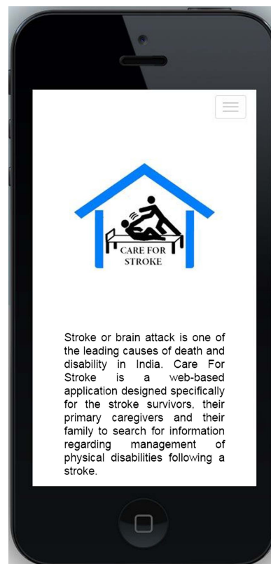
Figure 2 Introductory page of the 'care for stroke' application.

This application is exclusively designed to support digitised audio-visual content. More than 75% of the content of this application is in the form of videos. The users can interact with the images related to the main sections and watch the videos about stroke and the management of physical disability post-stroke