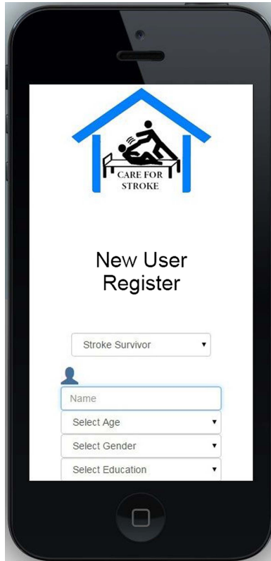
Figure 3 Registration page.

performing brushing, feeding, dressing, etc. Please find the section web page in figure 6 .