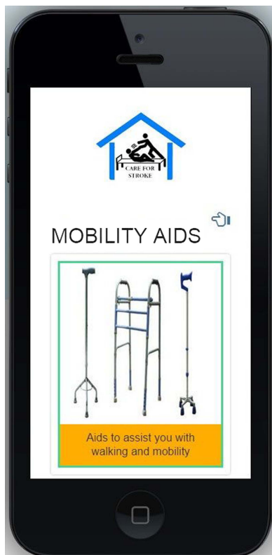
Figure 6 Subsection page.

patterns of this application by the users can be tracked continuously and reports can be generated to inform the feasibility of this intervention and also to monitor the progress of any programmes/research projects related to this intervention when scaled up to a larger community of stroke survivors. The administrator can also add videos onto (or remove videos from) the application as and when required, thereby customising or improvising the content of the intervention according to the needs of the users. The module is protected and strictly secured through a username and password to ensure privacy and confidentiality of the user information.