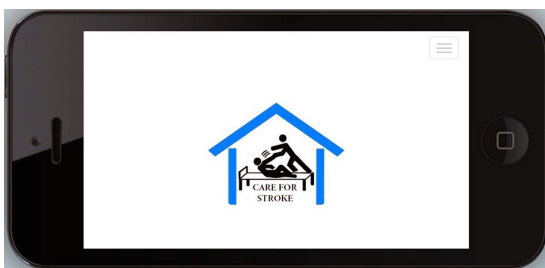
Figure 1 Logo of the application.

The tagline of the application is 'Think Smart—Take Control'. This tagline emphasises the importance of proactive, innovative and smart planning for therapy and rehabilitation services that the stroke survivor and their caregivers should execute, outside the hospital environment. It also encourages the stroke survivors to take control of their problems following stroke and work towards an independent life after a stroke.