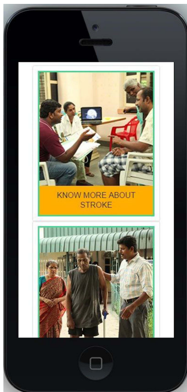
Figure 4 Intervention page.

This Smartphone-enabled intervention is built with an administrator module, where the usage and utilisation