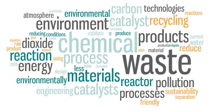
Figure 2. Visualization of the most frequent words used in the online discussion.

To determine if the participants incorporated sustainability concepts and practices into the online discussion, a word cloud was generated from the forum posts (Figure 2). All the posts from the online discussion were imported to Microsoft Word with a ProWriterAid add-on (Oxford, UK). Redundant words such as the author's last name and the last name of the author of the reading assignment were excluded from the word cloud. The whole class focused primarily on the environmental, economic and scientific aspects of sustainability as words such as environment, waste and chemical were more commonly used. However, the commonly used words did not directly relate to politics, culture and stakeholders.