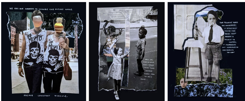
Figure 3 Emotion and Experience has Contributed to Diverse Concepts and Ideas.

Although NCL-FAD faced a year of challenges due to Covid restrictions, this cohort continued to reflect the successes of previous NCL-FAD student progression. All students applying through UCAS were offered places on degree programmes, with the majority securing offers from first choice universities. Each year, a small minority of students choose not to progress to HE, with some seeking apprenticeships where possible or taking a 'gap year'. This year, approximately six from a cohort of 87 students chose not to pursue an undergraduate degree,