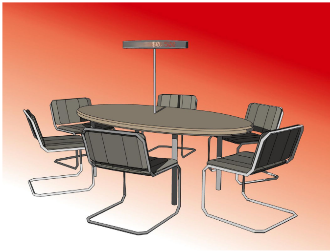
Figure 2: The Meeting Cost Counter

meeting (including overheads). This information is then displayed on the circular screen mounted above the meeting table, which updates every second.