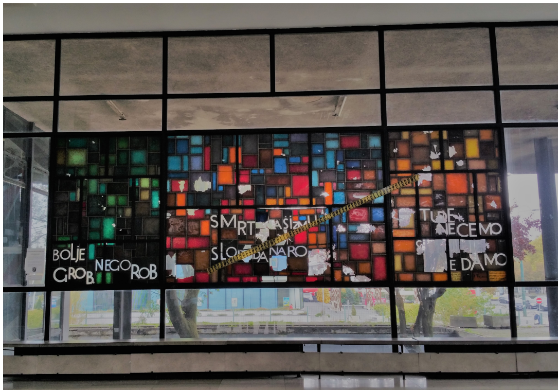
Figure 3. Stained glass artwork in the entrance hall, The Historical Museum of Bosnia and Herzegovina.