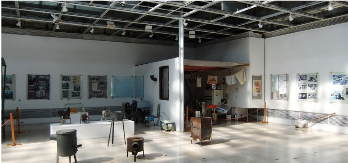
Figure 4. Historical Museum of Bosnia and Herzegovina, Main exhibition hall with The Siege of Sarajevo exhibition.

shared identity, remembered, resented or surpassed. Generally unrepresented in the Western discourse, this complex built heritage is often hastily ‘othered’ as ‘Eastern European’, a ‘part of the Communist Block’, and a space behind the former barrier of the Cold War.