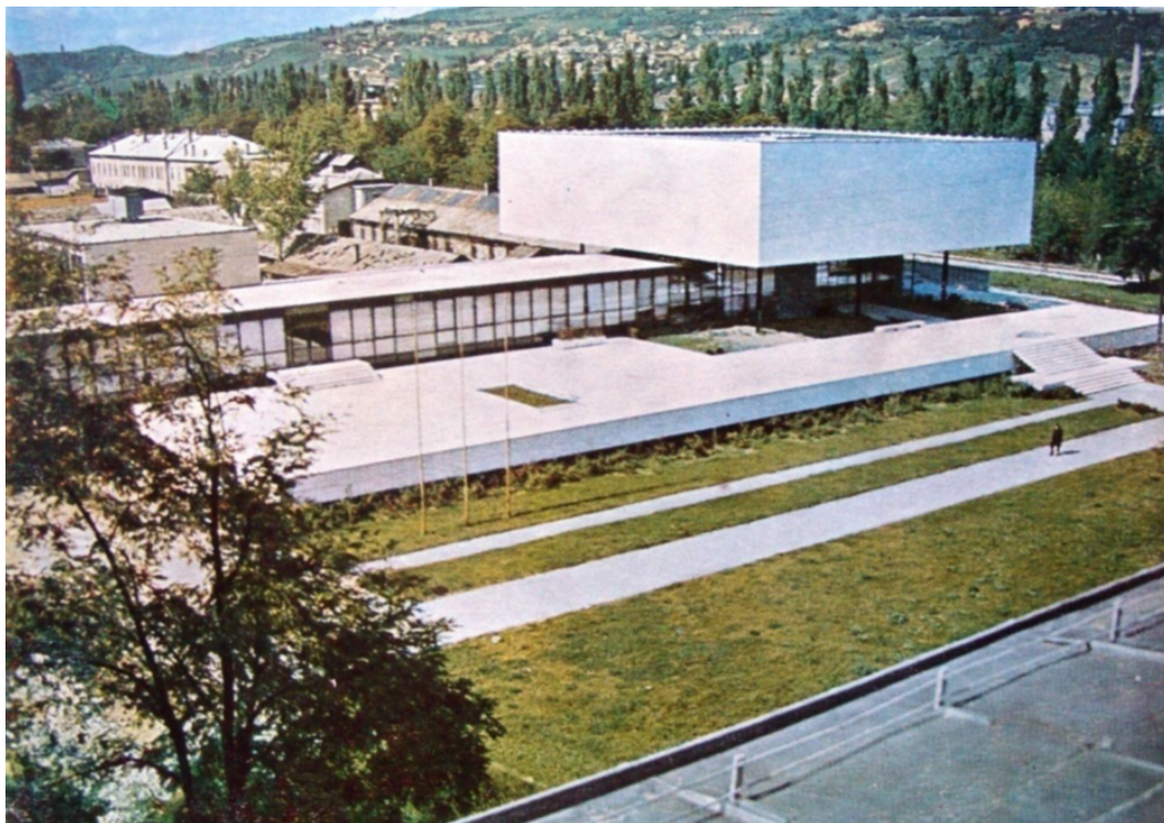
Figure 2. The Museum of Revolution building, 1964.

The burning of the National Archives in February 2014 during a hastily coined ‘Sarajevo spring’ was an added episode in this process (Skorupan-Husejnović, 2014). The claims regarding the extent of damage to the building and especially the archival documents from the Austro-Hungarian period were controversial, but the short-lived popular revolt revealed deeper problems felt by many. As a result, the cultural heritage agenda sunk deeper, from neglect to ignorance and vandalism.