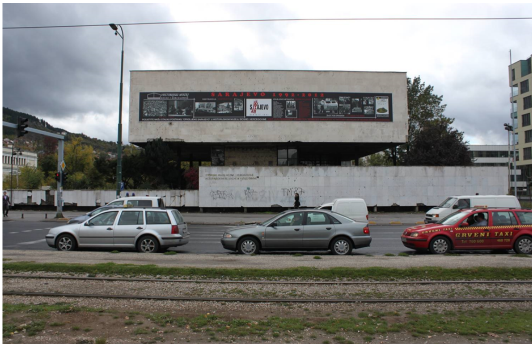
Figure1. The Historical Museum of Bosnia and Herzegovina, Sarajevo, view from Zmaja od Bosne street

At street level, the Historical Museum building looks somewhat dwarfed by the height of its newer neighbour, the neo-Modernist volume of the Austrian Sparkasse Bank. The Museum's main exhibition block, nicknamed Kocka [the Cube], hovers over the battered street-level stone-clad wall, which hides the recessed glazed base with the main entrance, accessed from a slip road over the raised terrace (See Fig. 1). The street façade is over-ridden by the black and white banner, reminiscent of a celluloid film ribbon, evoking the French philosopher and cultural historian Pierre Nora's coined phrase 'the ephemeral film of actuality' (Nora, 2001). Mounted in 2012 to commemorate the 20th anniversary of the war, the red lettering "Sarajevo 1992-2012" over background images of atrocities and the dark visual language of the banner seems to be appealing to the urban film-watching generations of post-Yugoslav Bosnia and Herzegovina, and to international tourists.