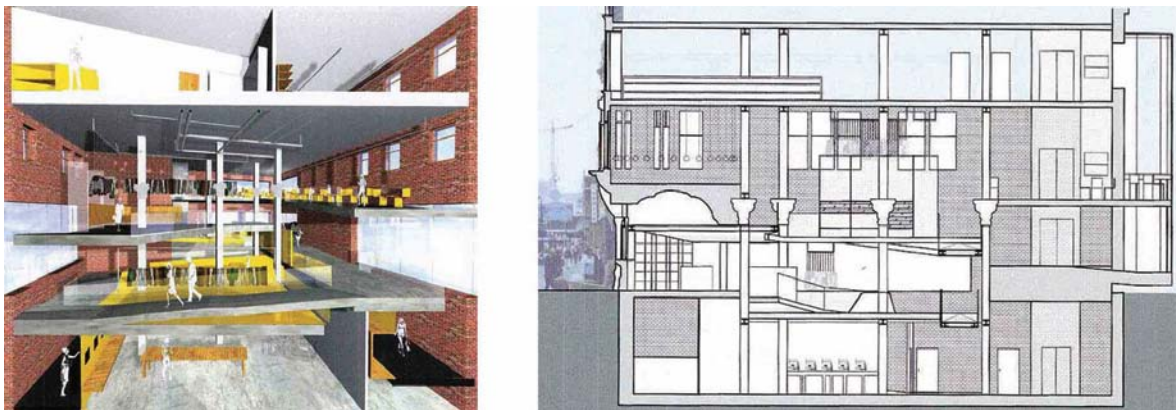
Fig. 3&4. Composite capitals reveal contrast between the old (existing) and new (remodelled) strata of the interior.

With this in mind, we can visualise the archaeologist as an imaginative figure with the creative sensibilities of the poet allied with the craft of the sculptor and the dexterity of the surgeon. We are drawn to imagery of the aesthete. Can we then attribute such sensibilities of intention and approach, of care and attention to detail, of precision and reverence to the practice of integration and intervention into an existing building?