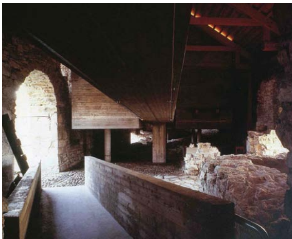
Fig. 5. Horizontal contingent space adds to the geological strata.

This proximate dialogue is evident within Sverre Fehn's Archbishopric Museum of Hamar for we can consider this work as an example of this exercise in participation with the storytelling of a history of built place. As Fehn's building encompasses and canopies the site of archaeological interest, its relationship with the past is as such that it allows the processes of archaeology, in its scientific and anthropological sense, to continue. The building rests upon the remains of a medieval fortress in a manner that is more revelatory than insubordinate and as such participates in this new history. The building acts as the discoverer and preserver and becomes a continuer and biographer of this history. The building is the creator and curator of the very artefacts used to elaborate on the story mapped out within the contingent space between the fortress and the intervention, 'displays unfold like a story; they are organised like voyages to instances and situations at different points in history'. vi The contingent space is primarily horizontal in this instance, forming and adding a new built stratum to the geology of the site and of the story of place.