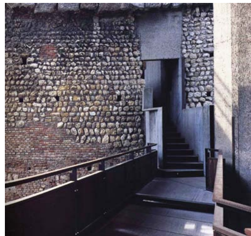
Fig. 6. Breaks in material and surface

Within this context of re use and remodelling of existing buildings, the story is often one of shifting scales, from macro to micro. The story is told via the relationship between the juxtaposed built forms