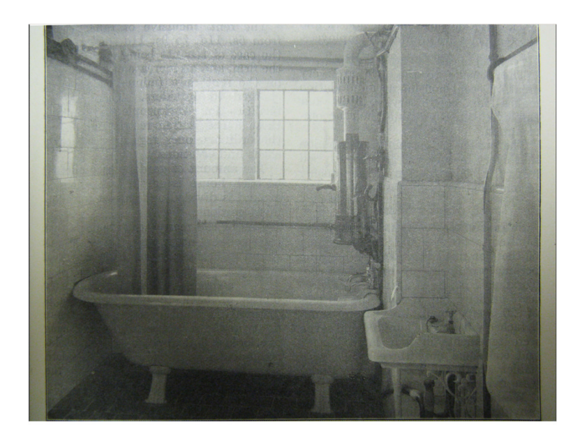
Image 5. Photograph captioned "a bathroom at the Letchworth factory of the Spirella Company (of Great Britain) United, where the employees work under ideal conditions," <u>Industrial Welfare</u> 5 (June 1923): 159.