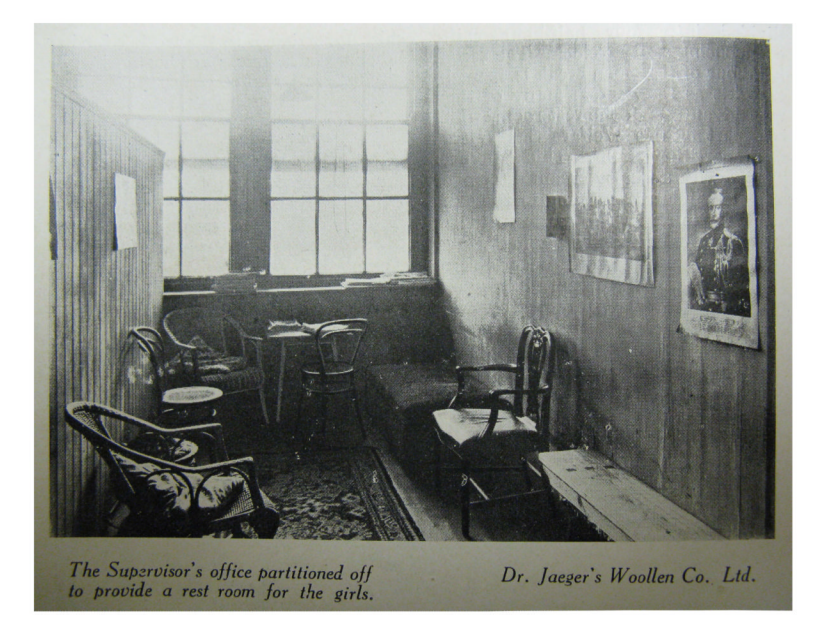
Image 1. Rest room, Dr Jaeger's Woollen Company. "Welfare in a Congested Area," <u>Journal of Industrial Welfare</u> 2 (July 1920): 225-8.