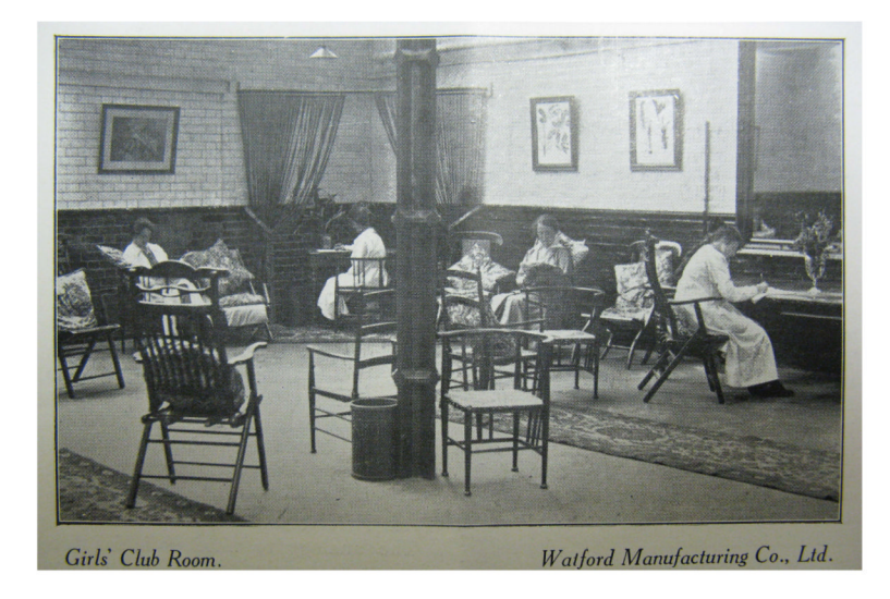
Image 3. Girl's Club Room. "The Employer's Motive: What a Visit to Delectaland Revealed," <u>Journal of Industrial Welfare</u> 2 (February 1920): 40-44; 40.