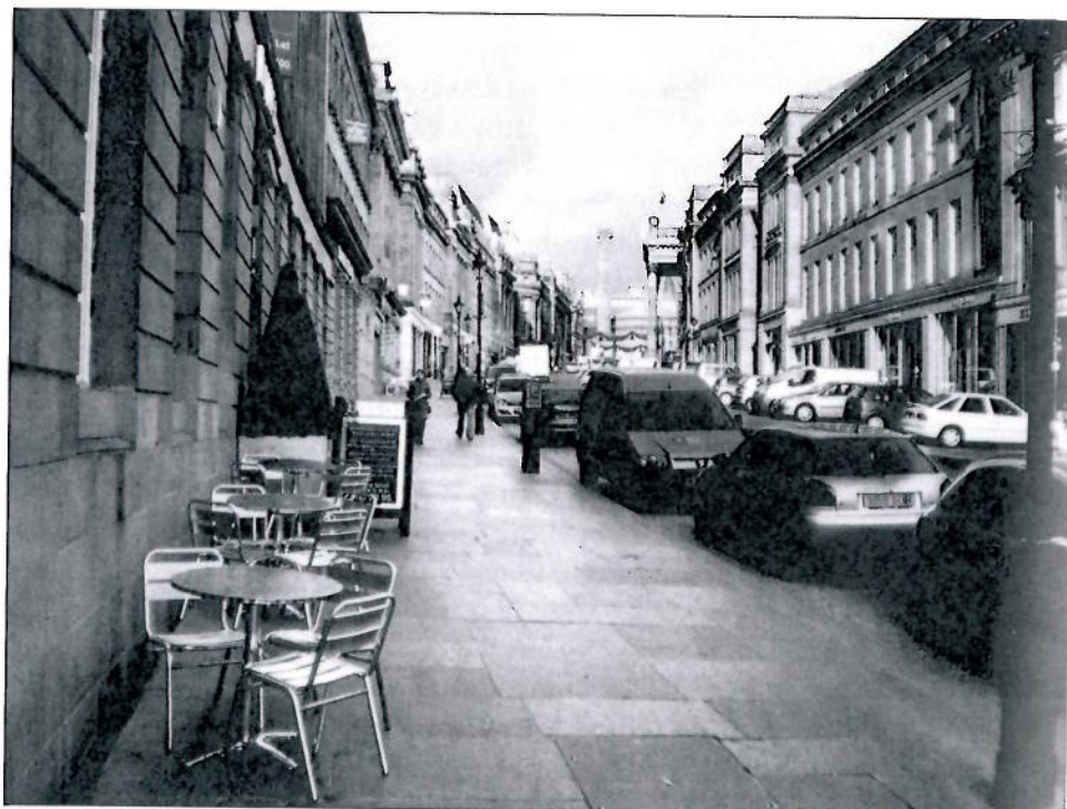
Grainger Town – Sustaining the historic centre of Newcastle upon Tyne. Grey Street is architecturally one of England's finest streets, at the heart of the Grainger Town Project.

In a subsequent detailed survey of the condition and vacancy of buildings in the area it was found that there was a high number of listed buildings "at risk" (244) in terms of disrepair or vacancy (47% against the national average of 7%) and a considerable number in a "marginal" condition and vulnerable to becoming "at risk" (29% against the national average of 14%).