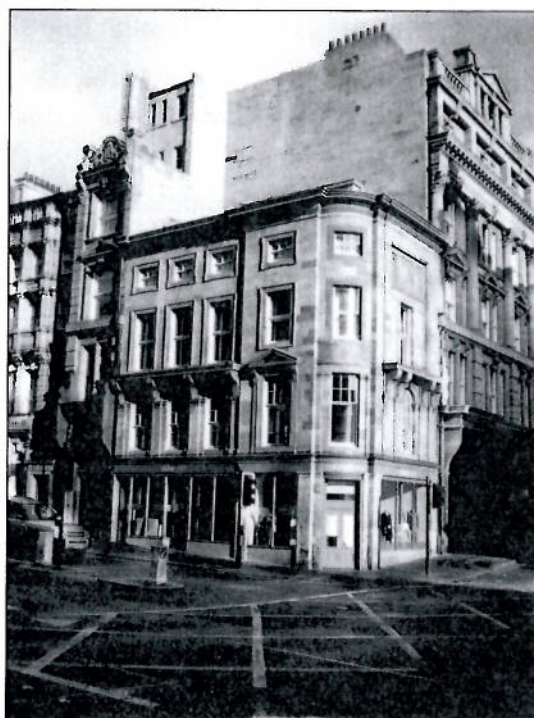
Grey Street (a) and Grey Street (b). Numbers 2 to 12 Grey Street. This listed building was unoccupied for over 20 years and suffered considerable disrepair. After the threat of a repair notice and the possibility of compulsory acquisition, the building was rehabilitated and is now a fashionable hotel. (R. Pickard)