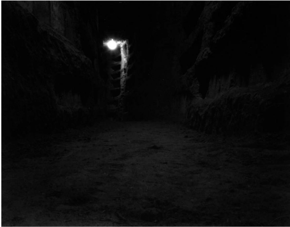
Fig 2. Catacombe #13 2001/2. Archival Pigment Print on Cotton Rag from B&W pinhole negative.