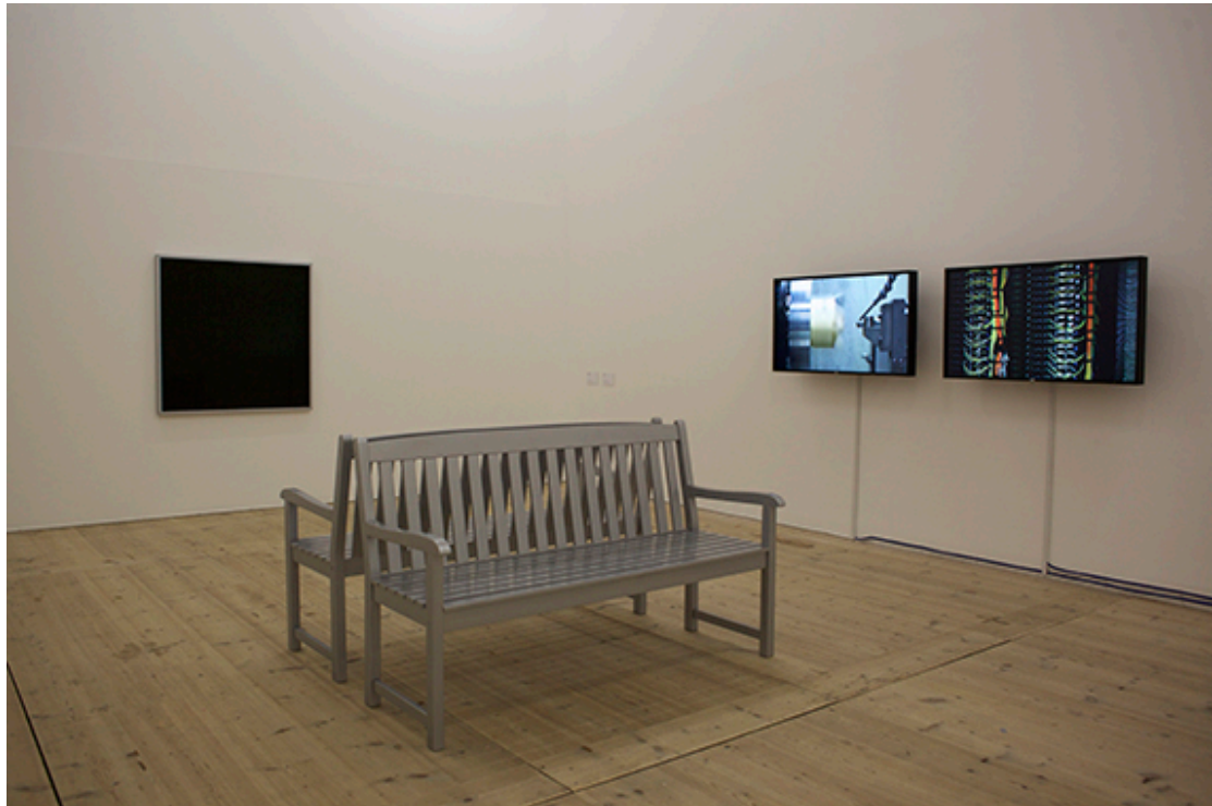
Fig 3. Negative Capability (Extraordinary Renditions) 2013. BALTIC Centre for Contemporary Art, Gateshead. UK © Fiona Crisp

It is important to note that my work is not concerned with imparting subject-specific knowledge: just as I avoid any claim to a documentary subject, I also eschew the notion that my visual practice in any way ‘demonstrates’ ideas within science and technology. Often the co-option of art by science for public outreach or research impact purposes (sometimes actively promoted by organizations and funding bodies) is highly problematic, especially where “science is understood as complete, and as needing only to be communicated or applied, while art provides the means through which the public can be assembled and mobilized on behalf of science.” (Born and Barry 2010: 103) The exhibition and symposium, Extraordinary Renditions: The Cultural Negotiation of Science (Crisp et al. 2013) produced at BALTIC Centre for Contemporary Art for the British Science Festival attempted to actively critique this model by framing visual practice, not as an