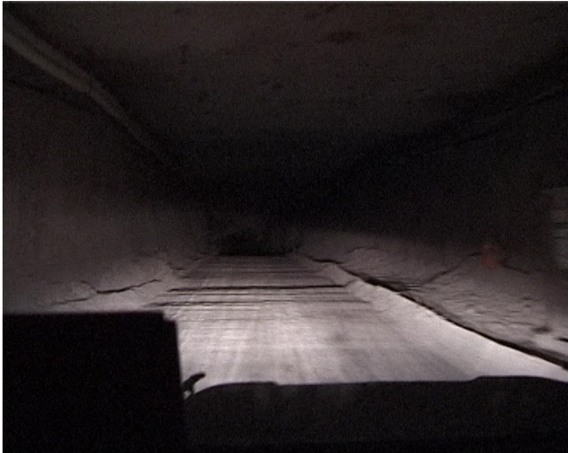
Fig 4. Boulby 2013. Film Still. Single channel digital video