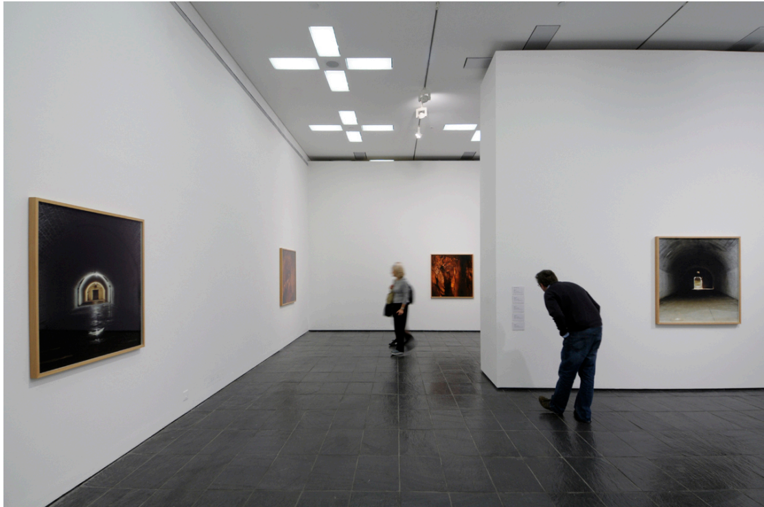
Fig 1. Subterranea 2009/10. Installation view. BALTTIC Centre for Contemporary Art, Gateshead. U.K.

My roots as an artist are in sculptural practice; in this respect I consider the language of mass, space and physical presence to be my mother tongue, but I now work mainly with non-documentary photography and film, making large-scale installations where viewers' spatial encounter with the still or moving images are carefully choreographed. The installations often make use of tropes of seating associated with particular forms of public "looking" or reception of information, for instance church or meeting hall benches, gallery furniture, or the ubiquitous park bench. The seating, if successful, 'positions' the viewer in relation to the work in visual and conceptual terms whilst at the same time offering a haptic encounter with material surfaces, eliciting a simultaneous sense of distance and intimacy; much of the work plays with such dichotomies of interior and exterior or public and private space, and the seating's role is central to both splitting and conflating these realms.