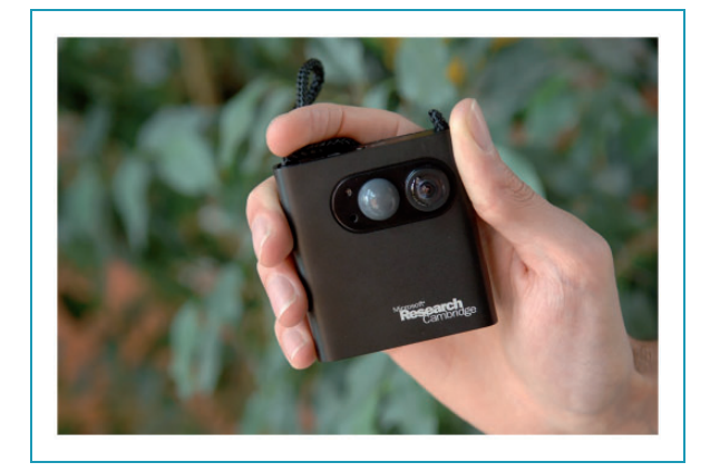
Figure 1. The Sensecam.

The Sensecam is a small, light (93 g) camera and is worn on a lanyard around the neck, resting on the user's chest. The Sensecam comprises a camera ( 640 \times 480 pixels) with a fish-eye lens to provide a horizontal 130-degree field of view.<sup>32</sup> The Sensecam automatically captures at least one image every 30 seconds (Figures 2 and 3).