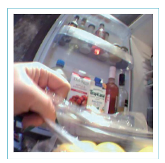
Figure 2. Image recorded by the Sensecam depicting food preparation.