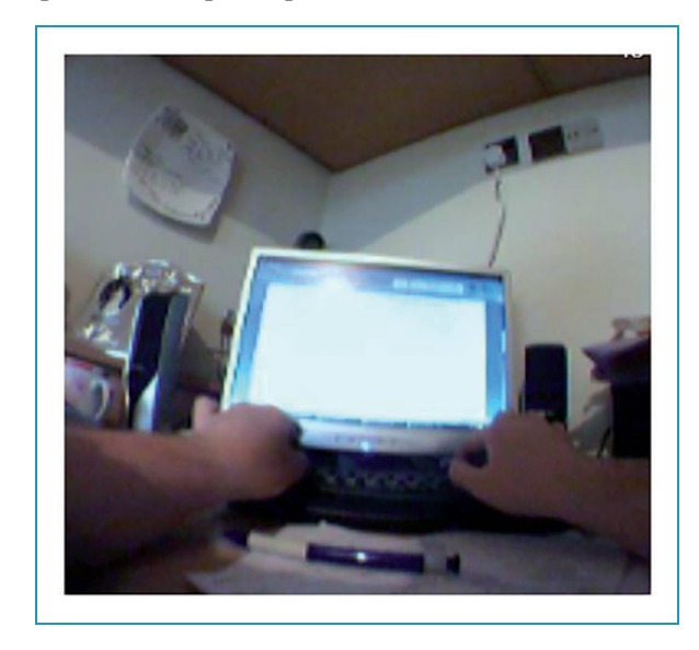
Figure 3. Image recorded by the Sensecam depicting use of a desktop computer.

The interview schedule comprised 20 questions which explored the participants' views on the wearable