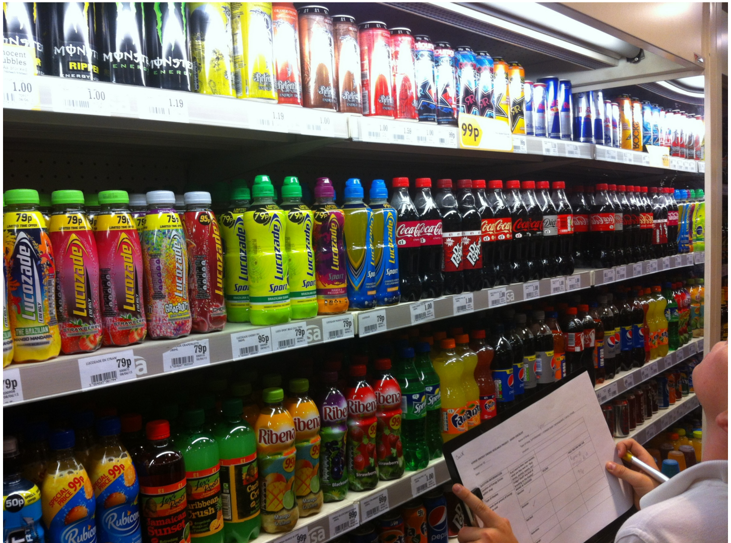
Fig 1. Photograph taken during participatory mapping exercise.

https://doi.org/10.1371/journal.pone.0188668.g001