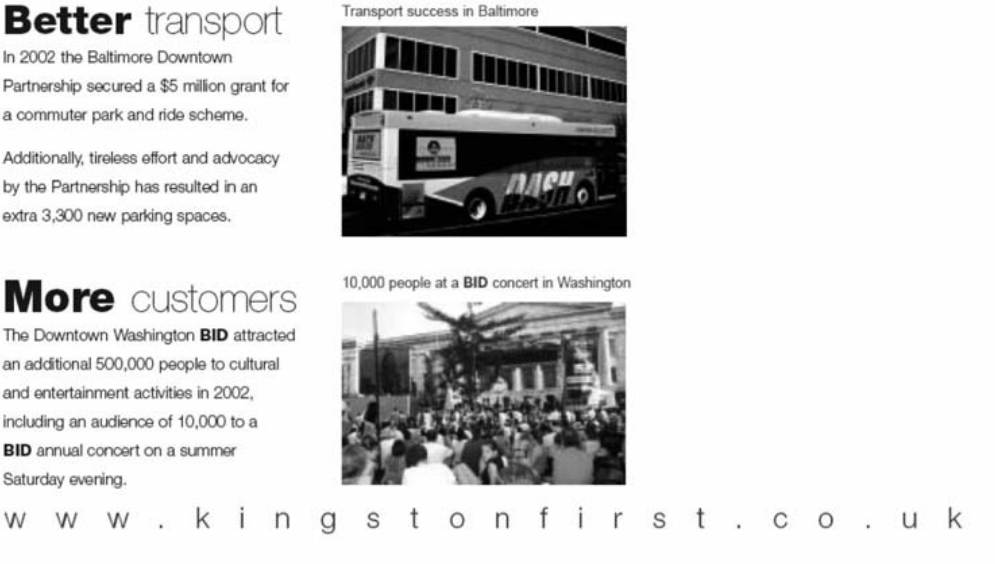
Figure 2. Associative legitimisation of BIDs through the successes of the ECDBIDs