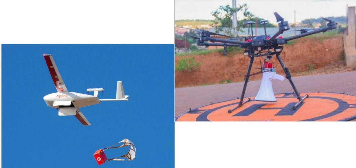
Figure 3: Innovative use of drones to fight Covid-19 in Africa

where drones are being deployed for facilitating testing and Covid-19 announcements as shown in Figure 3.