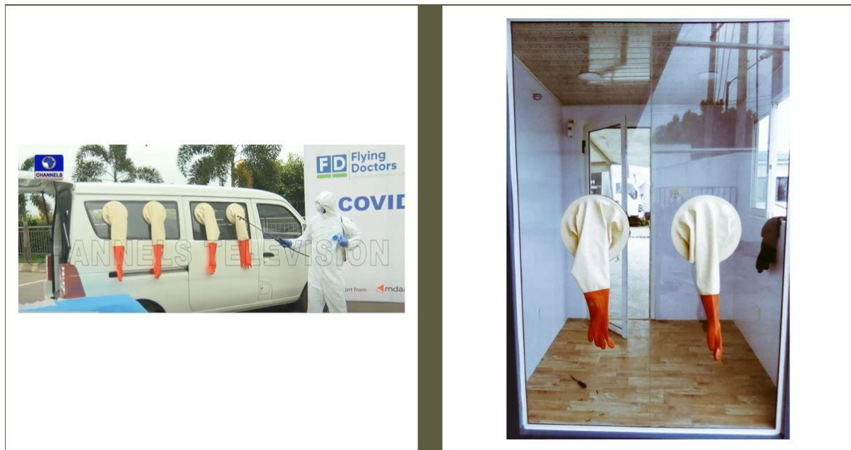
Figure 4: Flying Doctors' zero contact Covid-19 testing booths