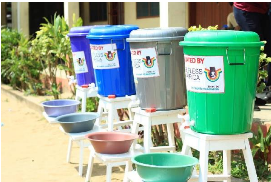
Figure 2: The Veronica Bucket

In Ghana , ‘Veronica Bucket’ - a repurposed dustbin-like plastic receptacle with a tap and wastewater collecting-bowl (see Figure 2) - is placed across public places in cities and villages to facilitate handwashing in the absence of tap water to help mitigate Covid-19 contagion (Pilling, 2020). This local invention was engineered by Veronica Bekoe, a public health official from Ghana, used during the 2014 Ebola outbreak and now being adopted by other west African countries where running water is largely lacking.