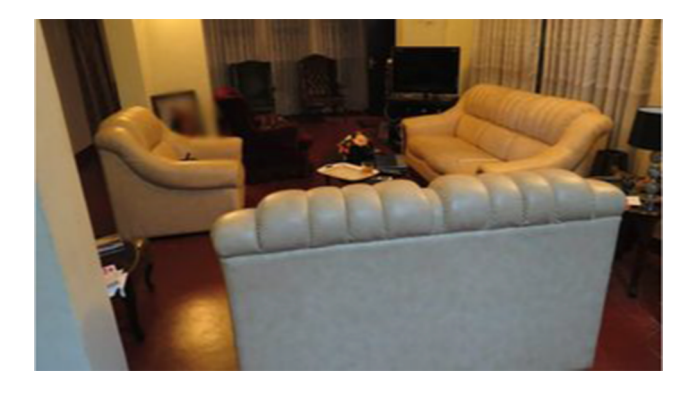
Modern sofa that was purchased and given to Uvani (F) and Nishan (M).

Bridging capacity is the ability of domestic materiality to prompt and support a range of different individual, relational, and collective boundary crossing pursuits during extended family formation. Prior literature suggests that marriage into extended families involves a gradual movement from outsider status to family insider; such boundary crossings are deeply anchored in domestic materiality (Fernandez et al., 2011). This transition from outside to inside is a key function of bridging capacity, but not limited to it. We conceptualise bridging as a gradual reconstitution of family structure and character through changing intersubjectivities. For example, Nilan (M) and Uvani (F) preferred a contemporary style in their new home, including bright wall colours and modern furniture items. As a result, Uvani's father reconfigured his dowry giving tradition by offering to buy them new furniture, rather than passing down heirlooms. Although the actual furniture shopping trips included multiple disagreements, especially between Nilan and his father-in-law, they ended up purchasing what they desired and were grateful to their parents. This newly formed intersubjectivity between the new couple and the bride's parents, bridged a boundary between two relational dyads and strengthened their relationships within the extended family.