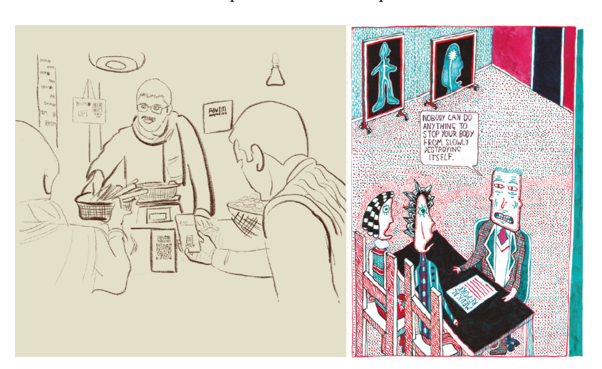
Fig. 4. Left: A road-side merchant using digital payments for daily transactions, Digital illustration, Pranjal Jain, 2021; Right: We Hate You, Enormous Leering Skull (excerpt), Ink on Paper, John Miers, 2019 [8]

Finally, we will create a digital/physical artists' book in the style of a gallery catalogue - de-centering text and celebrating the artists' creation from the workshop. This will be made open access and available for download and print.