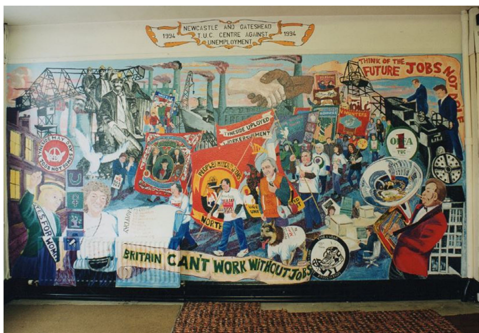
Figure 1: Newcastle Unemployed Workers' Centre mural [Color figure can be viewed at wileyonlinelibrary.com ]

particularly significant as trade union support for similar movements in the 1920s and 1930s was often limited, and sometimes overtly oppositional. Such opposition often centred upon an anti-communism sentiment as found in parts of the official trade union movement in the early 20 th century (Watson 2014).