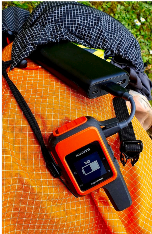
Fig. 5. The Garmin inReach of P08 attached to a battery pack for recharging near Fort Augustus, Scotland.

The participant profile could have been more diverse and perhaps reflected wider opinion; for example, there was only one female among eight TGO participants. The recruitment process started several months prior to the event, and participants were selected based on their intention to participate in the TGO and their indicated use of technology when backpacking. Efforts to have a more balanced participant profile were unsuccessful.