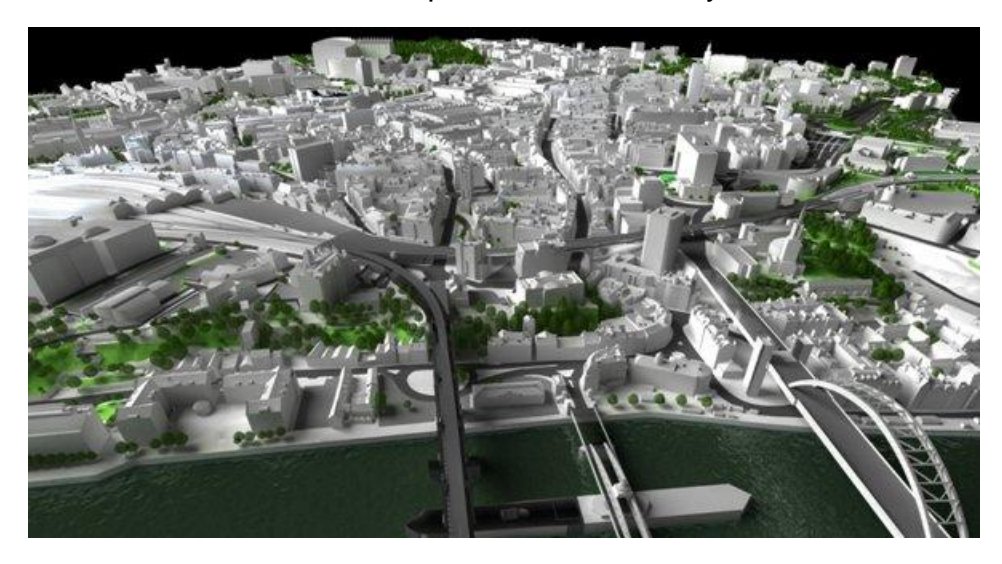
Figure 2 city model to date (Context model © Zmapping Ltd 2008)

models. However previous research (Whyte 2002) observed a lack of utilization of models that had been created by academia. An alternative collaborative relationship between academia, local authorities and other interested parties was suggested as a way forward for the creation and maintenance of city models (Horne et al, 2007). Northumbria University's School of the Built Environment has well established professional relationships with urban planners, developers and architects in the region. Recent activities have included the integration of Virtual Reality into the built environment academic curriculum (Horne and Thomson, 2008) and the creation of a city model for teaching, learning and research purposes (Figure 2). The university is in a position to now undertake a coordinating and collaborative role with all stakeholders to further develop and maintain a city model.