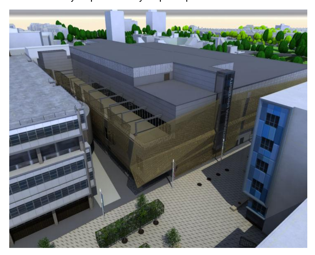
Figure 2 Several levels of detail within Virtual NewcastleGateshead

been identified as a key requirement by all participants.