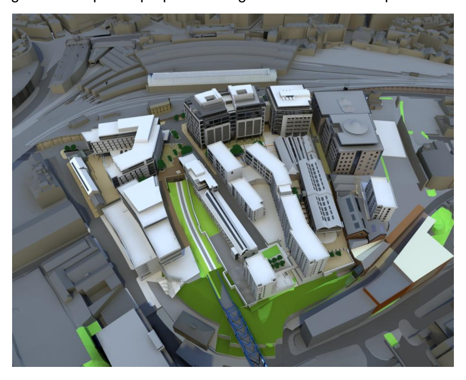
Figure 4 Stephenson Quarter Development Project (Silverlink Holdings Ltd, 2008)

VNG will offer urban planners, designers and clients a faster and more interactive way to assess the visual impact of proposed developments. Currently organisations offering 3D representations are working to different standards of accuracy and quality. VNG will create a working party to investigate standards such as CityGML. ifcXML – ifcGML and X3D as well more established formats (Ewald and Coors, 2005). CityGML is currently being developed to support the attribution and geo-referencing required by GIS applications (Kolbe et al, 2005). This will play a major role in supporting a growing number of 3D city models being created worldwide (Dokonal, 2008). A major development project in the private sector has enabled an assessment of the information sharing issues and compatibility of the city model data with regard to current 3D computer modelling practices. It has highlighted the need in providing 3D development proposals to agreed standards and protocols.