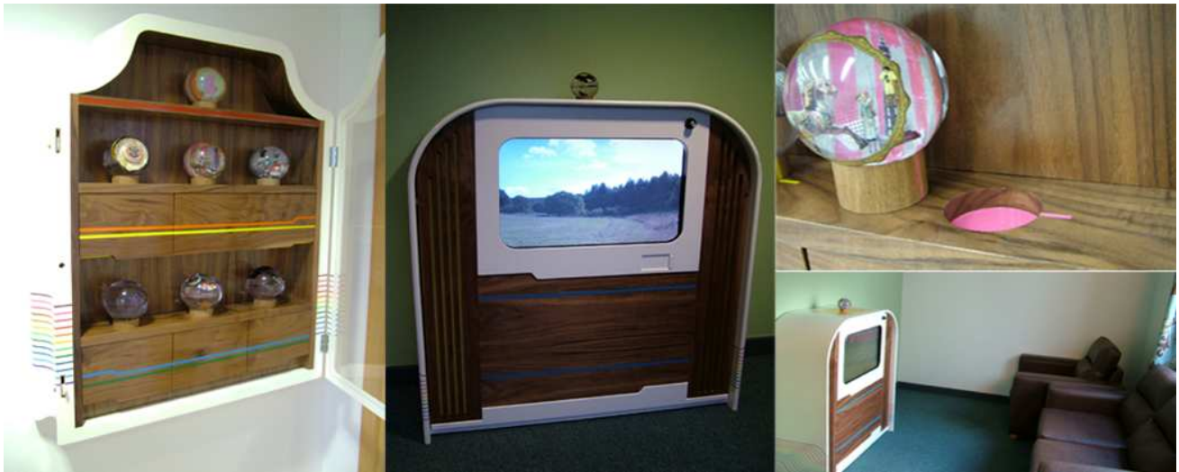
Figure 1. From left to right: The wall cabinet containing themed globes, the television cabinet with the Nature globe and Nature film playing, detail of Holiday globe with its specific color (top) and detail of the room locating the art piece (bottom).