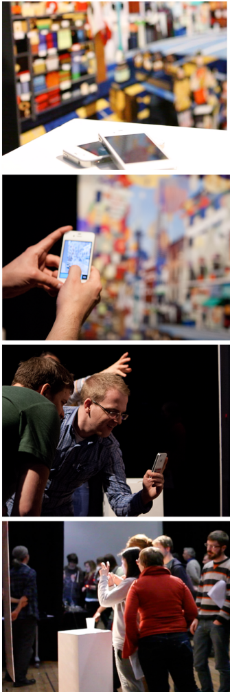
Figure 3. Exhibition shots of Repentir, using ceiling-suspended print of Transamerica.

an area, pixels from older versions of the painting are revealed under his or her finger as if they are rubbing away layers of paint. Consequently, the user is able to reveal the layers behind partial areas of the image and view pixels from multiple versions of the painting simultaneously. To achieve this partial rendering of layers, the image overlaid onto the painting is dynamically updated to display pixels from different versions of the painting, based upon which areas the user has rubbed. We envisage that future versions of the application might allow gallery visitors to create their own printable versions of the painting while using the rub technique.