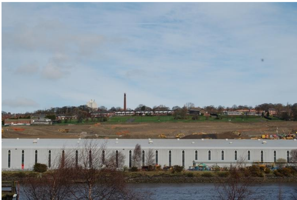
Figure 14 The Armstrong works with Scotswood beyond

The original GfG plans anticipated that 6000 homes would be demolished and these replaced with the building of 20,000 new homes across the city. 5000 of the demolitions were to be in the West End of the city which includes the Scotswood area. This required the displacement of existing lower income populations, moving to vacant local council housing in the city but not necessarily within their own area and the compulsory purchase of private homes. This met with fierce criticism and public opposition when it was announced. Critics argued that it would lead to the fragmentation of long-established communities. The Newcastle Community Alliance was formed from the communities involved demanding the council withdraw its demolition proposals and enter into dialogue, which it did but without providing an alternative. In sharp contrast to the official flags soon to adorn the city centre announcing the council's commitment to culture, the ECOC bid and the city's new, rebranded image, Scotswood was draped in homemade banners declaring 'We shall not be moved' (Guardian, 13 th September, 2000). The Liberal Democrats replaced Labour in the June 2004 council elections and announced that GfG would be scrapped, however 1500 homes had already been demolished and elements of the GfG were included in the Pathfinder plans known as Bridging NewcastleGateshead (BNG).