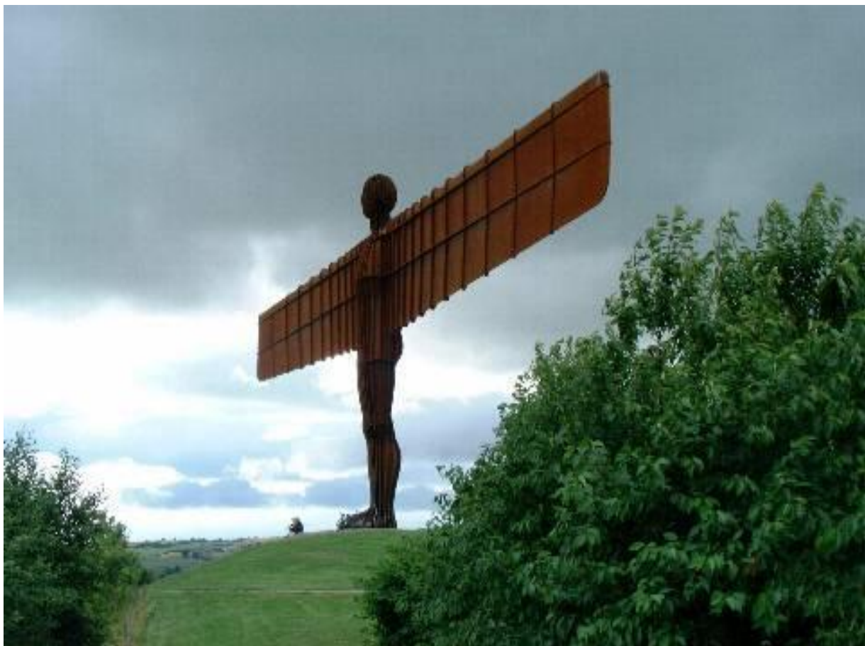
Figure 1 Antony Gormley’s Angel of the North – erected in 1998 and viewed by many as a sign of the regenerated north of England

In the three sections that follow we explore attempts to represent and rebrand northern cities with particular reference to Newcastle-Gateshead. The recently constructed urban image of the northern city and the cultural impression it creates exist alongside residual elements of urban landscapes, economies and cultures. Our enquiry looks in two directions – towards the real and towards the representation, and it attempts to chart the distance between the two. The first section outlines the background to the process: the transformation from industrial to postindustrial city; the political and economic changes associated with this; and the policy contexts that give rise to a policy driven concept of culture. The second section explores the form of urban rebranding and spectacle characterised by the image of party city with a reliance on advertising and consumption and certain forms of cultural participation. The third section involves a series of observations of two areas of Newcastle-Gateshead viewed through the filter of policy presentation, urban rebranding and spectacle. Our findings and conclusion point towards a considerable difference between existing reality in the area of culture and the social and economic fabric of northern cities and representations of the rebranded urban.