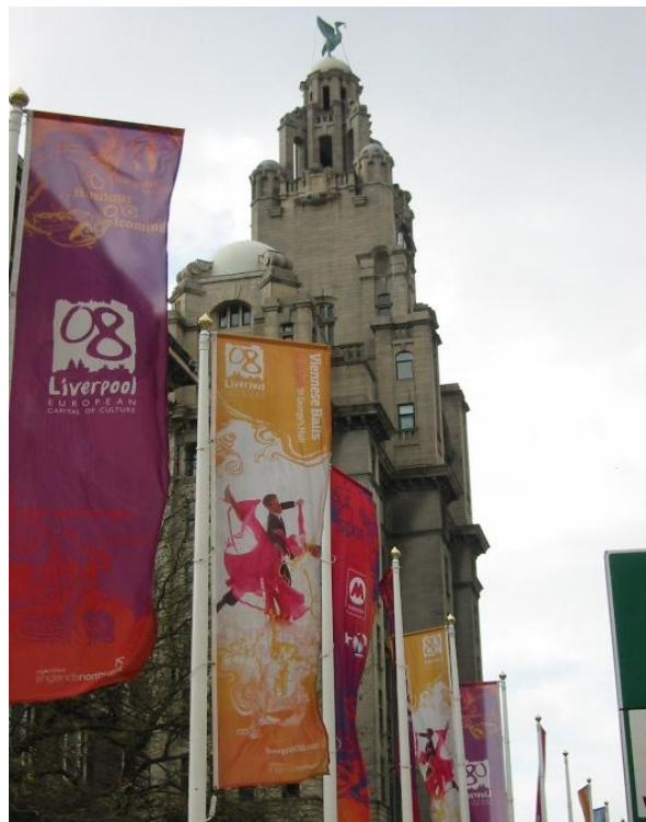
Figure 3 Liverpool's Liver Building with Capital of Culture banners 2008

In the next section we look at the form that city regeneration has taken and the image of urban rebranding, the spectacle of culture based on the party-city concept and a reliance on advertising, consumption and leisure as aspects of culture as a policy product.