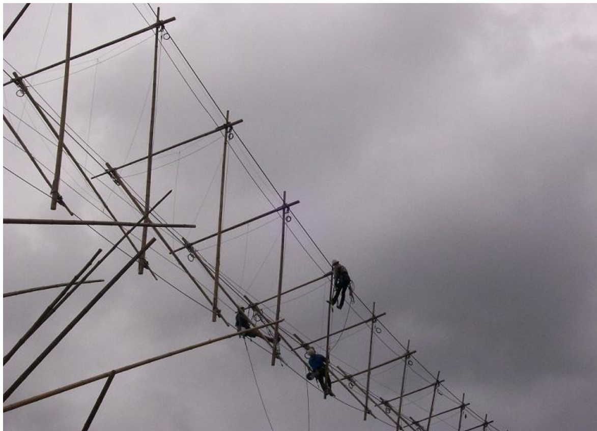
Figure 18 Bamboo bridge arts project spanning the Tyne, by Bambuco

Life is experienced, for most people in Britain's northern cities, as uncertainty, conditioned by the national and regional economic effects of the financial and political crisis. Politics, as it currently moves through most people's lives in the north, is about price fluctuation, job losses, and cuts to health and social services, education and cultural provision. In response to this a more volatile politics of community action, student protest, trades union resistance, and direct street action is gaining ground. This finds its place within a wider global environment in which the struggle for democratic rights and institutions predominate.