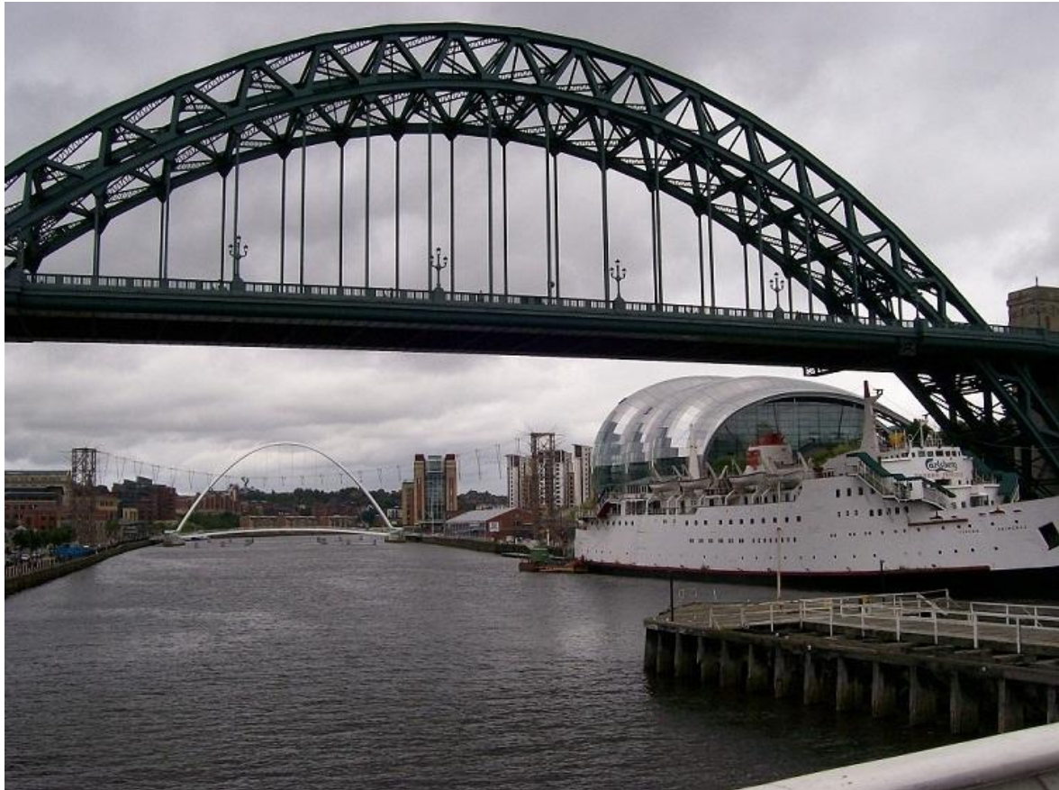
Figure 10 Newcastle's Tyne Bridge, Sage and Baltic

Away to each side, the buildings of the town centre reflect the decline of local retailing as it has been overtaken by other ways of consuming – the Co-operative department store finally closing in recent memory – while some proud, assertive, buildings – ‘1925’ – push themselves shamelessly forward amidst the boarded up shop fronts.