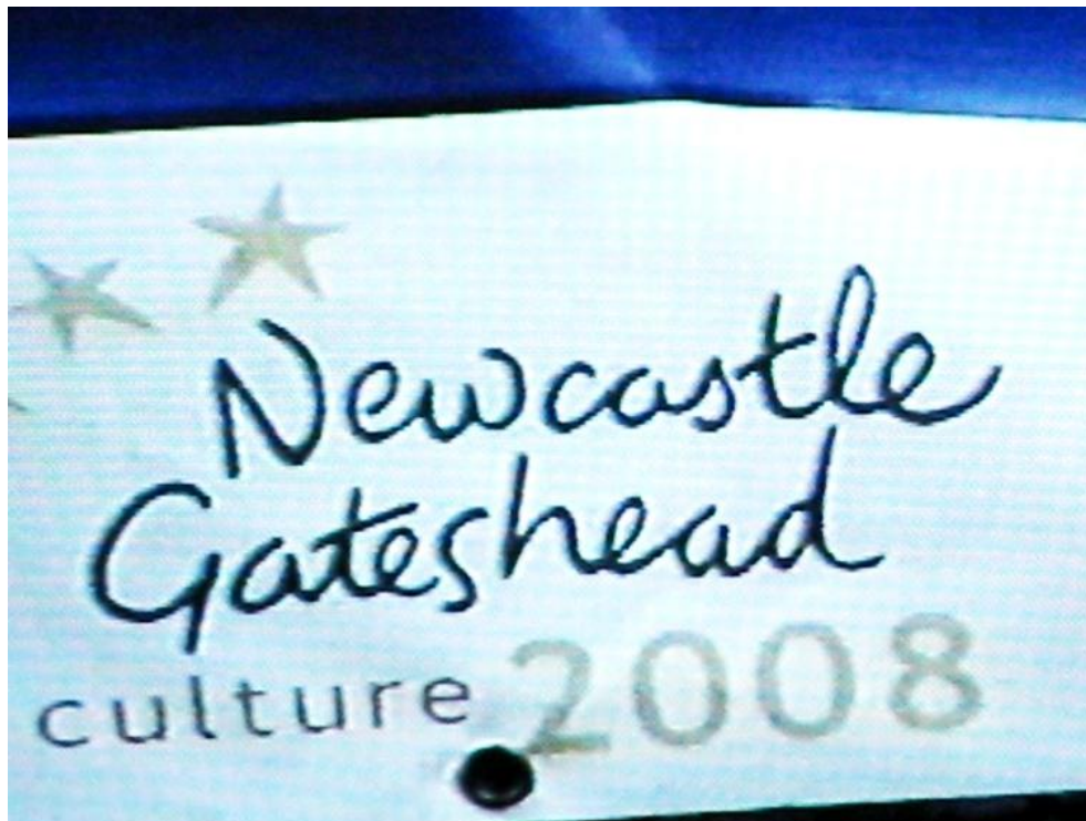
Figures 5 & 6 Newcastle-Gateshead banners - love the buzz & culture 2008