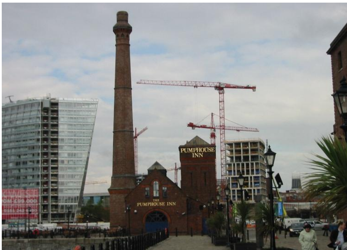
Figure 9 Liverpool regeneration 2007