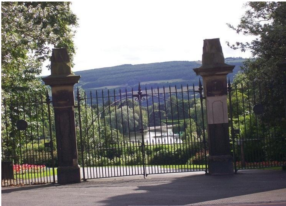
Figure 12 Saltwell Park, Gateshead

those pausing for a drink as they contemplate public transport back to the start of this journey are confronted with a painted depiction of the Angel bidding welcome to a public house...thus it stands as a symbol for the immediate area (Gateshead not Newcastle), the region as a whole (the North not the South), transport, alcoholic drink, retailing, estate agency – the Agent of the North, lunch for office workers – implausibly enough, the Bagel of the North – and wherever else the imagery leads. The symbol is both inclusive and exclusive, depending on audience, time and context. The walk between two prominent cultural reference points demonstrated above all that they are only part of – indeed, they are overwhelmed by – the innumerable, and largely unrecognised, cultural reference points in between.