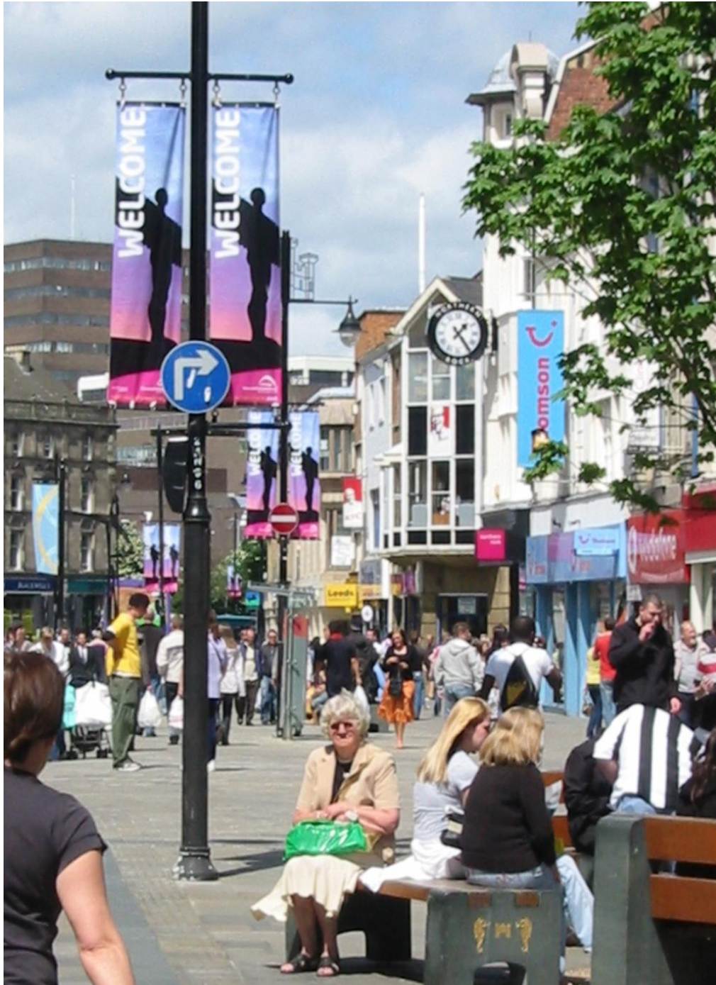
Figure 2 Northumberland St - Newcastle upon Tyne's main shopping street with welcome angel banners