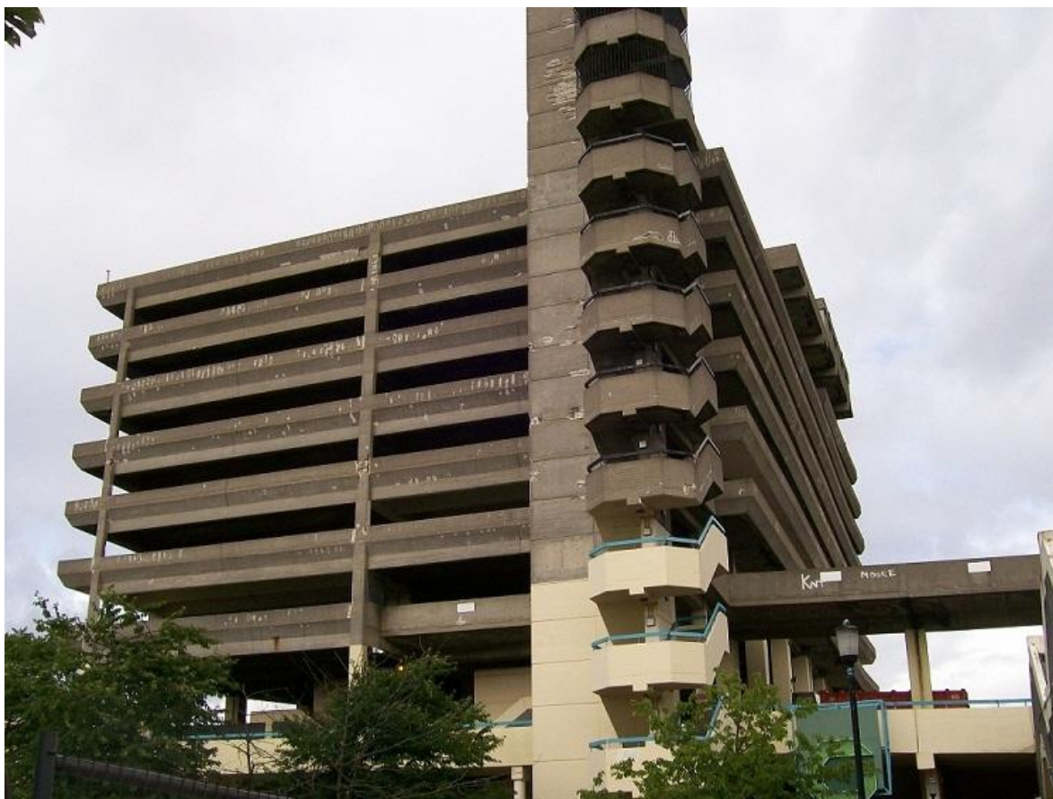
Figure 11 Gateshead's car park

Past the contemporary Civic Centre - the modern political site of local administration - through the terraces and the orthodox Jewish community which has long roots here alongside an urban working class and its schools and Christian churches, and then coming across older embodiments of public culture in the shape of the Central Library, the Shipley Art Gallery, alongside the stone-fronted building of the former Education Offices and its promise of what would once have been called 'betterment' and enlightenment. Then immediately to the delightful prospect of Saltwell Park, its gates firmly locked today as part of a council workers' strike, but a view through the iron bars accentuates the arcadian imagery of this rural idyll, deserted and silent, looking across to the green fells beyond, amidst what was industry and pollution before the disappearance of the old economy (Figure 12).