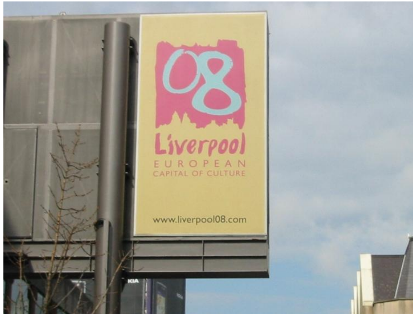
Figure 4 Liverpool celebrating European Capital of Culture 2008