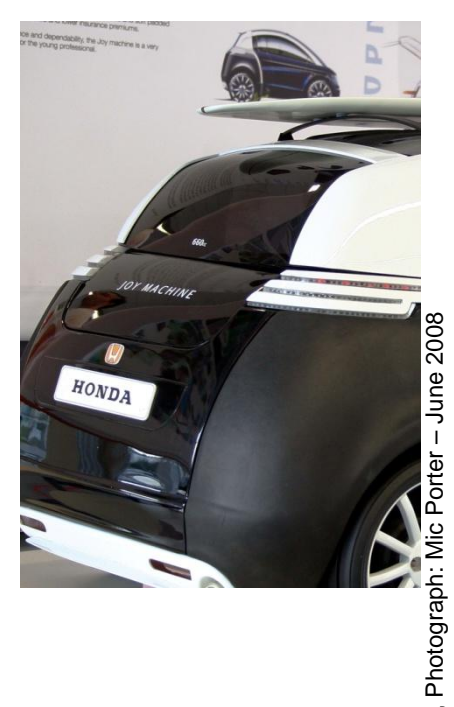
Figure 1: Student car design

The student of Geography who writes an excellent essay that unwisely contains unattributed quotes is unlike to find their work displayed in a public exhibition or inside the evening newspaper. This is not so for the work of the developing artist or design student whose work may receive wide and, effectively, uncontrolled publication. As a result of such open display the work may come to the attention of people or organisations that may be unhappy with the adoption and exploitation of their intellectual property. They might raise the matter with the student alone but perhaps, also insist on dealing with the University concerned believing that the IPR law has been broken or breached in a non-trivial manner.