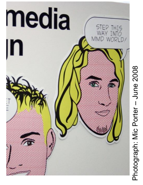
Figure 3: Student Exhibition poster,

others and often support this by openly publishing or exhibiting their work. A builder was asked to re- create the design of a house but when the "reinterpretation" was seen by, the original architect, took legal action for copyright infringement, and won. (Byles, 2007). The use of design trends or a particular style is common in architecture as it is elsewhere in the creative disciplines and the training courses that serve them. It maybe that the design solution proposed is expected to be sympathetic to the environment/site/context in which it would, if constructed, exist. Any context jarring impact-arousing shock must, usually, be avoided or moderated. However, how can it be made clear what is acceptable reinterpretation and what must be original work. How may such boundaries be established and communicated? Should a student proposal for a "Tudor Style" development or a "half timbered station wagon" ever be acceptable and the design work highly rewarded? These issues and questions cross all the creative disciplines and sub-disciplines.