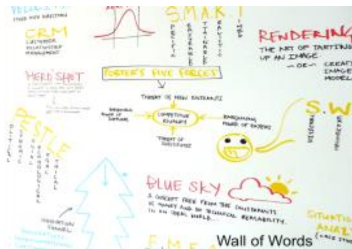
Figure 3: 'Wall of Words'

Gen Doy explains that students and researchers who move from one discipline to another “encounter languages and cultures which may seem alien, or perhaps welcoming. They feel uncertain and lacking in confidence sometimes, because they do not feel “at home” in the new discipline...”. (Doy, 2008) As a greater understanding of each others’ language is gained and the prototype is refined, not only will a common language be learned, but a common vernacular for multidisciplinary innovation practice will develop and become an ‘at home’ in a space tailored to support this development.