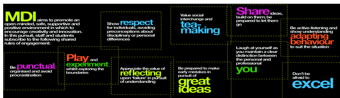
Figure 4: Terms of Engagement

Perhaps the most relevant of these to conclude this paper relates to “active listening and adaptive behaviour” and “respect for individuals”. The programme focuses on developing the individual and their confidence to participate through the ‘safe environments’ described. The importance of the individual cannot be over-stressed as it is only through self-awareness that the individual can become an effective team member. Staff and students have to be adaptive and flexible in their approach and willing to admit when they don’t know the answer! This approach has allowed the building of a strong dialogue between students and staff that will guarantee mutual reflective, innovative and creative learning.