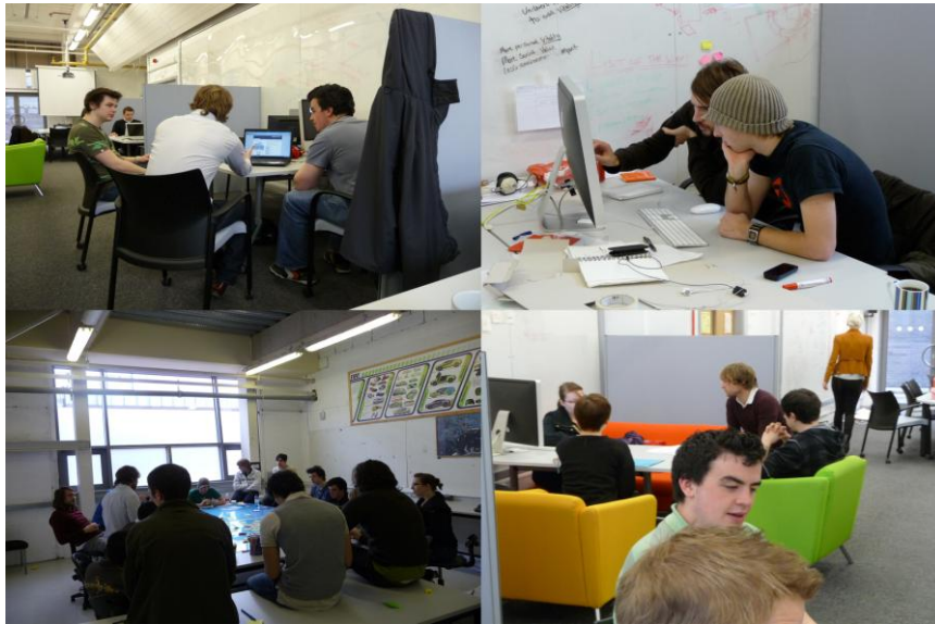
Figure 2: Adaptive Learning Environments

Establishing an equality of voice is essential to establishing equality of value (and confidence) within the group. From a disciplinary perspective, this necessitates the promotion of honesty in acknowledging what activists don't know as much as what they do. Seeking a common language as disciplines emerge is necessary for effective working (Kimbell and Seidel, 2008) and as equality of voice is established, students can start to identify true collaborative value. One student commented at the end of a recent project;