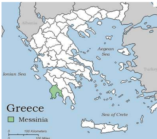
Map 1 - Messinia region , Greece

The Union of Agricultural Cooperatives (UAC) is located in Messinia region, Greece. Lying at the south-western most tip of the Peloponnese, Messinia covers an area of 2.991 square kilometres, has 210.000 residents and is administratively separated into 29 Municipalities and 2 communities (Map 1). It enjoys favourable climate conditions, in combined temperature, humidity, etc. for producing high quality farm products for health and special flavour, and recognition by the EU as PDOs for these reasons. The capital of the region is Kalamata, the most important harbour of the Peloponnese after Patras.