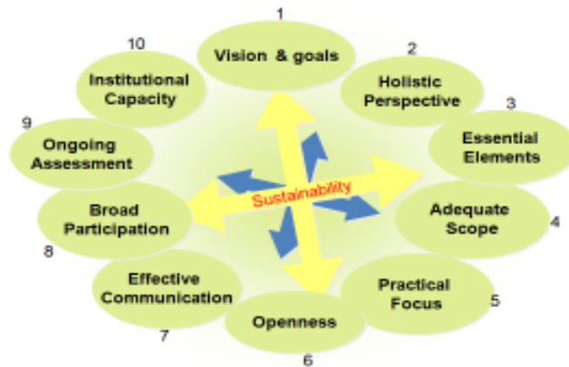
Figure 4 – The Bellagio Principles towards sustainability

In any case, the frameworks, the categories of data, the information and the choice of specific measures, reflect the values, biases, interests, and insights of the participant designers. In addition, value-driven principles are often developed as part of strategic planning exercises linked to such interests and various initiatives. The provision of insights and guidelines for attaining competitiveness and sustainability requirements, under variant product and market conditions, is critical for regional SMEs that produce high quality agricultural products, like the following case of Union of Agricultural Cooperatives, in the Messinia region, Greece.