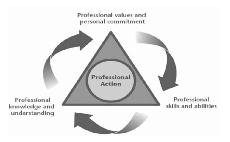
Fig 2 The Inter relationship of the main aspects of professional development (The Standard for Childhood Practice 2007)

A Pedagogy for Work-based Learning at Level 5 for Foundation Degree Studies in Architectural Technology and Construction Management