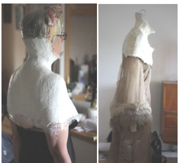
Figures 3&4. Plaster cast of shoulder area