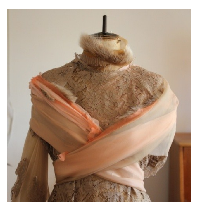
Figure 5. Torso Development from plaster shoulder cast

learning in how we use materials.Somaesthetics gives a philosophical understanding as to how tacit skills are imbibed into our physique, our soma.