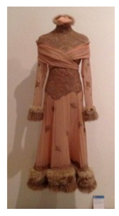
Figure 9 Final Garment

examining and re-creating new iterations. Thinking through our bodies is an important part in how we recognise multimodal aspects of the creative process. Our understanding of our own soma has the potential to make an important contribution to feelings of empathy with the end users of our creativity. The process in designing this garment has been a considered act of doing, thinking through my body to create an item that when worn could resonate with another through the felt experience of wearing the dress. The way the garment restricts and allows movement, the textures felt against the glabrous hairless skin (palms and soles) and with hair skin of the user somatically inform the user of how they wear the item. The somaesthetic response of wearing a garment could be said to be an empathic response of the design process and vice versa. Our bodies are a key focus in how we learn and the vehicle, the physical container of our worldly experiences and knowing.