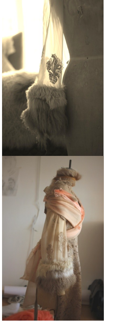
Figure 6. Sleeve cuff in stretch chiffon with welded sheepskin cuff structure Figure 7. Development of the silhouette

me and many designers the actions that inform my knowledge that then through reflection and new synthesis inform my doing and creation in the use of new materials to create new products. The tactile processes of feeling through my body and fingers inform my sensations on what the fabrics can do, in other words their potential to bend, yield, explode, crack, flex, drape, and mould to my expectations to create something new. It is this thinking through feeling, thinking through my body that has informed this garment and how it will encourage awareness of the users own body through restriction and play.