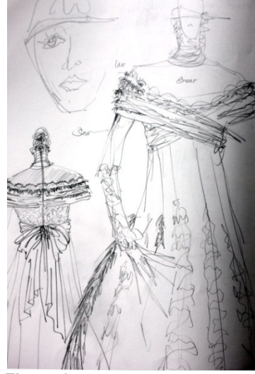
Figure 2. Exploratory sketch to inform construction

another via sensory input from prioperceptive nerve endings in muscles, tendons and joint capsules' (Shusterman 2012). It is for