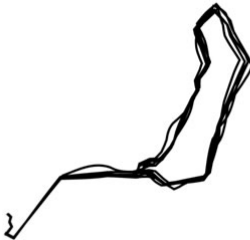
Figure 2: Seven daily dog walks

Compare that with the following diagram, which records my daily dog walk over seven days: