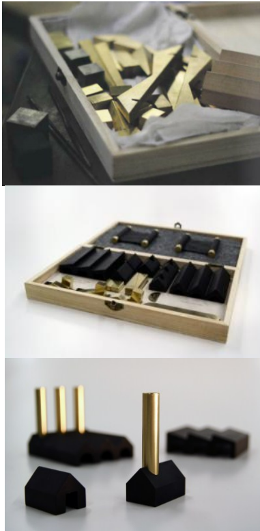
Figure group 2. Desk Top Empires.

A series of wedges, vee blocks, shims and packing blocks that can be used in a machine shop or can be transformed into your own Desktop Empire. These devices are important in holding work steady for accurate precise machining of engineered and designed product. The Blocks are wrought from Iron, Mild Steel and Brass with design skill.