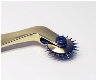
Figure 11 Wheel Section, Sex Bolt is too large