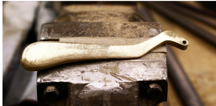
Figure 9 Filing and refining final tool

The journey and understanding between each different design discipline, 3D product and fashion, has led to a wider knowledge in hard and soft materials and the performance qualities of hand tools. The process has brought a mutual acknowledgement in how we explain and communicate ideas through pre sketch, actions, conversations, metaphors and the different vocabularies of each discipline. Performance of the user is inextricably linked to the performance of the tool and has impact on the creative flow and intentions of the creator. Disposable tools impinge on how we feel about our craft processes whilst using them. We are more conscious of the negative sensations of the tool in use. A tool that becomes a seamless extension of our selves and where we become less conscious of its presence enables an interrupted creative flow. When we put the tool away, look after it, we take ownership of its function and ability to perform for us in a pleasing manner. This in turn builds pleasurable memories of positive use, creating a virtuous circle of care, use and performance.