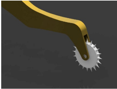
Figure 7 CAD illustration of wheel area