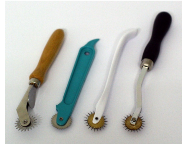
Figure 4 Examples of existing products, their handles and wheel structures

weaknesses. The cheap, disposable products available on the market were neither visually appealing nor ergonomic in handle design. Fig. 4