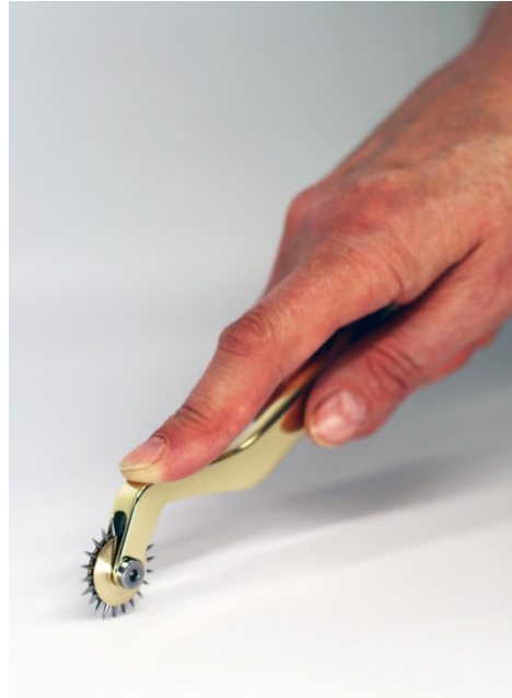
Figure 1 Final Design

This cross discipline collaboration was initiated to create a design tool that enhances creative use and accuracy in fashion pattern construction, a tracing wheel. A tracing wheel aids the pattern designer to translate a 3D Moulage design developed on a mannequin into a flat paper pattern. This pattern can then be used to create a final garment with accuracy in the desired cloth. The Moulage process is used by couturier houses to obtain complex shapes that are difficult to achieve through flat pattern cutting.