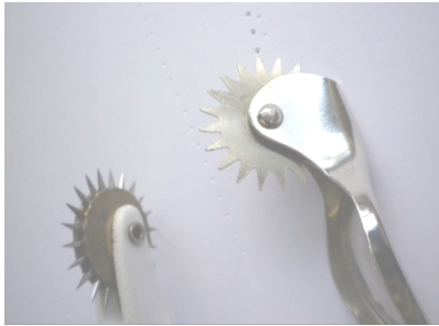
Figure 2 Existing Plastic handle Tracing Wheels The tool on the left has burs left by the plastic molding processes that are sharp in the palm of the hand. The tool on the right has a pressed metal wheel with blunt serrated points.