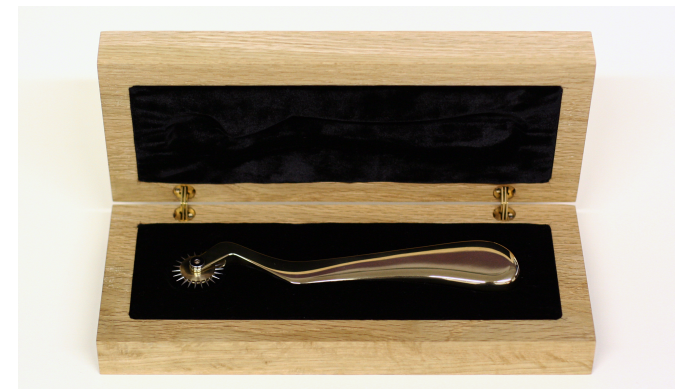
Figure 12 Finished design