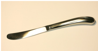
Figure 8 Contemporary Pistol Flatware

and processes required to create the tool. Discreet demonstration as in the hand movements and body gestures that accompanied the conversations which gave a richer understanding of the joint process we were undertaking.