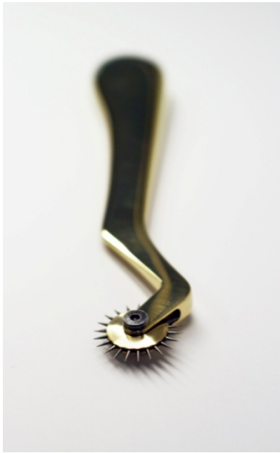
Figure 10 Finished design