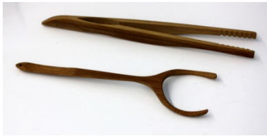
Figure 5 Japanese Bamboo Tools