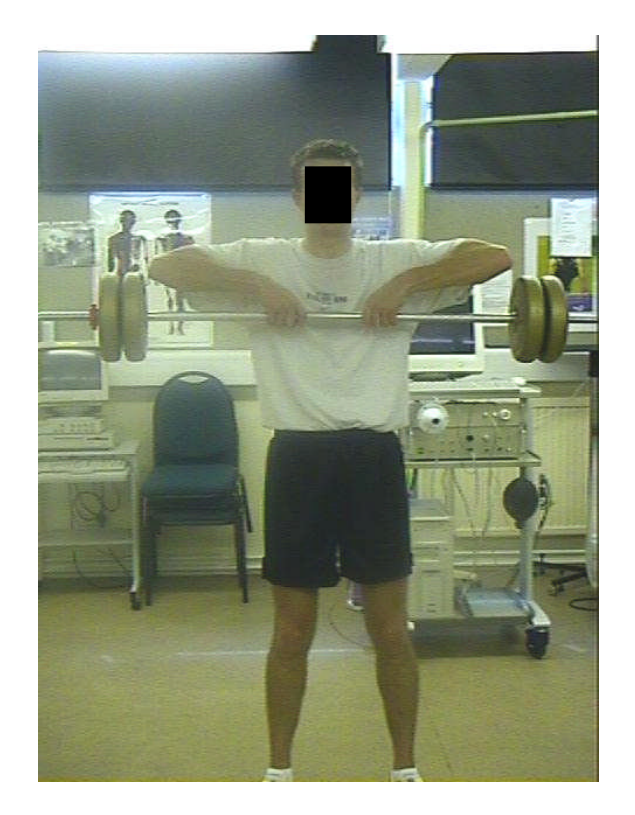
Figure 1. A subject performing the upright row test.