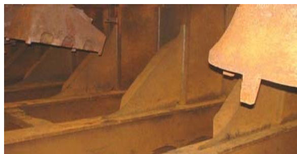
Fig. 1 Marine coating degradation showing rust in water ballast tanks [16]

Before 1880, solid ballast media such as stone, sand and rock were used [15]. These media were bulky and very difficult to handle especially during voyages in extreme sea conditions and resulted in long delays while ballasting or de-ballasting was carried out. These challenges drove the need for an alternative ballast medium and from the 1880s to the present day seawater became the preferred medium [15]. However, this medium came with the challenge of corrosion that ultimately led to the need for WBT coatings.