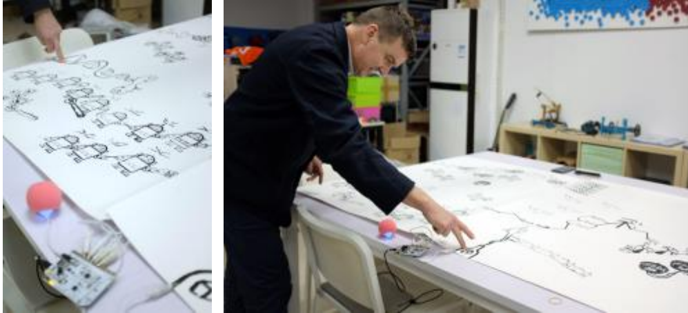
Figures 4 and 5: Final poster including the ‘touch board’ and speaker that enables the audio files to be played.

Simpson recognises the benefits of a dialogical, open-ended, ‘crafty’ approach, that perhaps can be contrasted with design workshops that aim for conclusive action and closure, rather than increased communication. As a sign of its success, Li and Simpson have repeated the workshop with a group of secondary school teachers, and it was again well received.