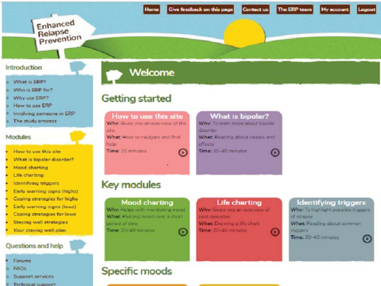
Figure 1. The online enhanced relapse prevention intervention (ERPonline) home page - top of page.