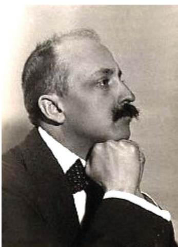
Image 1: F.T. Marinetti, the leader of Italian Futurism and a prolific manifesto writer, whose principles on manifesto writing have influenced our own.