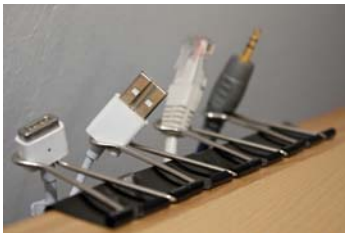
Image 6: Challenge #12: Start building the future you want, with or without technology.

that no matter how magnificent anything appeared, it could be swept aside into the debris of the past.'