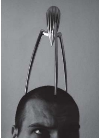
Image 3: Challenge #4: Bring an end to vacuous celebrity designer BS.