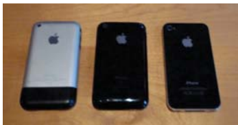
Image 4: Challenge #5: Interrupt legacy thinking and product lineages.