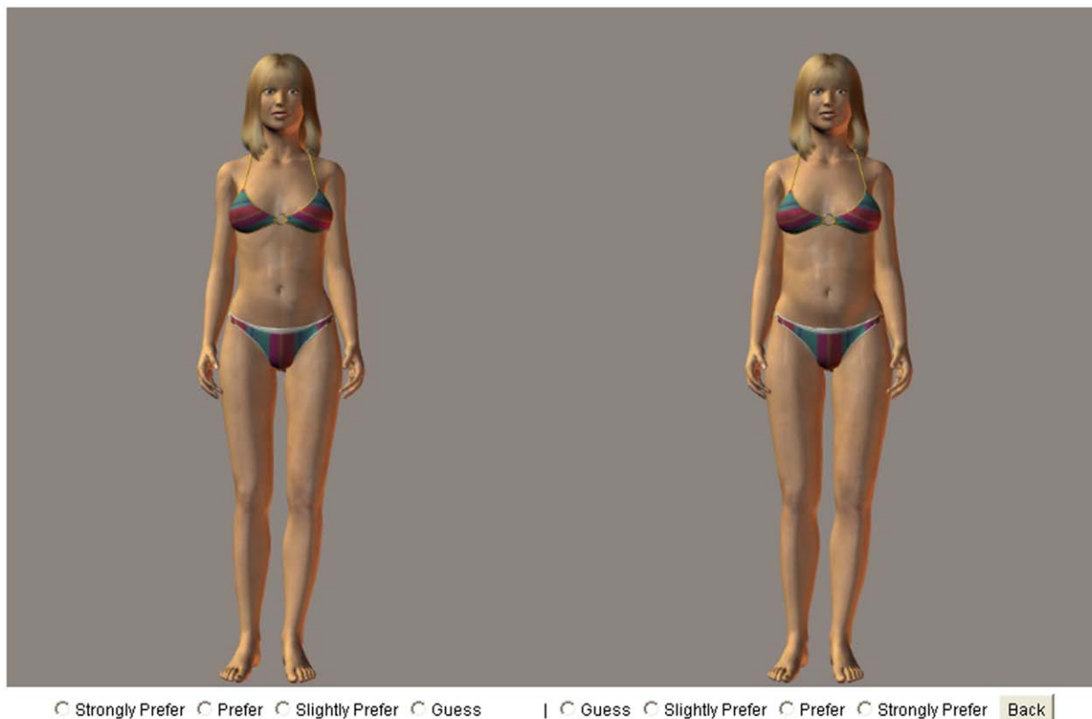
Figure 1. Example frame from the body size preference task. doi:10.1371/journal.pone.0048691.g001

Please indicate which body you prefer and how much you prefer it, by clicking on the line below.