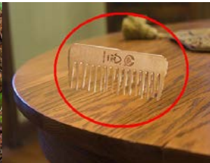
Fig 5. Artifact CONGRUENT