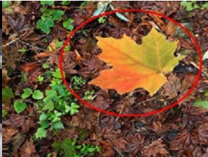
Fig 2. Natural Kind CONGRUENT