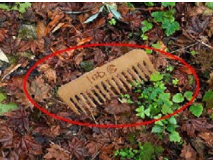
Fig 4. Artifact INCONGRUENT