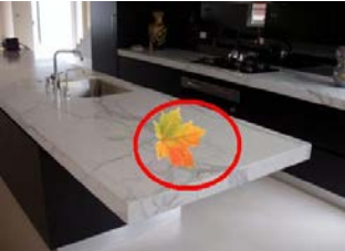
Fig 1. Natural Kind INCONGRUENT