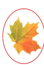
Fig 3. Natural Kind NEUTRAL