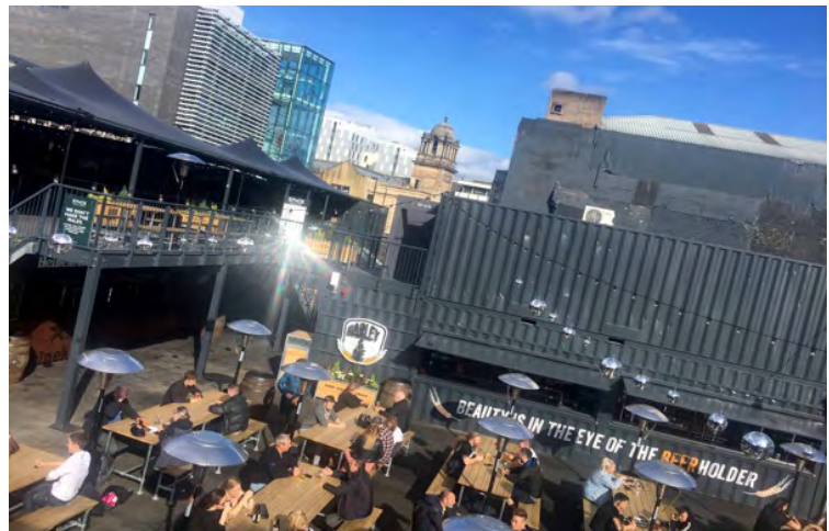
Figure 4 Stack Container Village, Newcastle upon Tyne

The configuration of the containers develops a migratory approach to the city, allowing the visitor to drift through the space, blurring the ideas of inside and outside space. A new intersection of how people use, interact and behave in the city is formed. It promotes the idea that you can be inside and outside at the same time, introducing a strong concept (favoured in many European models of culture) of bringing inside activities outside developing new boundaries and moments for the in-between space ( I-space ).