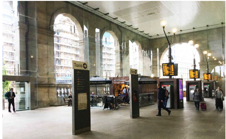
Figure 3 Newcastle Central Station Portico

McCarthy suggests that the boundaries of interiority are essentially abstract, rather than of solid substance. Although viewed as conceptual parameters, they delineate between the states of interiority and exteriority, where the boundary is transitory. Moreover, these intermediary borders determine the flexible and mobile nature of the interior, “making temporality an active condition of interiority” (McCarthy, 2005, p. 115). This notion of boundary is neither interior or exterior, but rather it exists within both realms and as such blurs the separation between inside and outside. This is highlighted by the Mobius strip configurations where the internal and external surfaces oscillate as suggested by Voordouw (2018). Instead, the terms interior and exterior are made redundant as prescriptive architectural terms tied to the physicality of the building structure. Now free of these constraints, they take on a more ethereal level of existence and meaning. Caan (2001) speaks of the interior, not only as a spatial zone but also on an emotional, intuitive and psychological level, discussing the interior space as a second layer of skin to the human user.