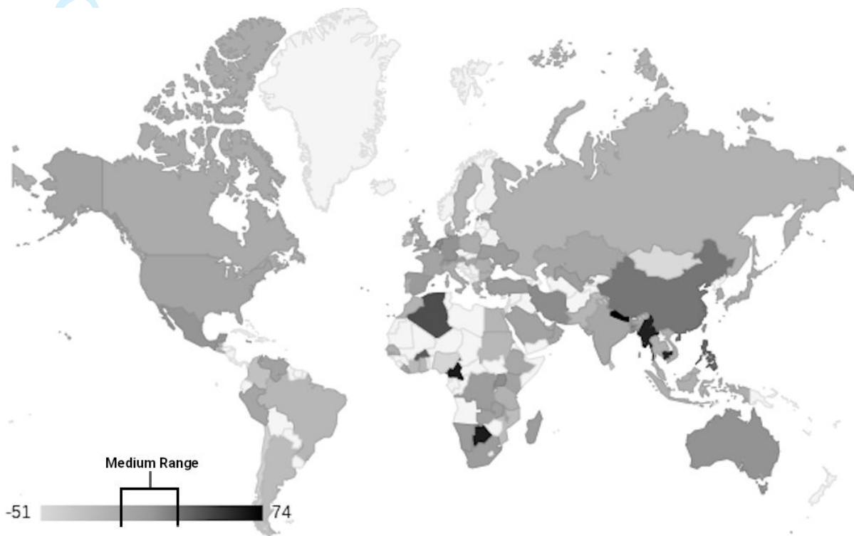
Figure 1: Difference in Rankings, White: No data, Medium range: no significant difference, Light: BOINC contribution ranking is much higher than Internet affordability ranking, Dark: Internet Affordability ranking is much higher than BOINC contribution ranking